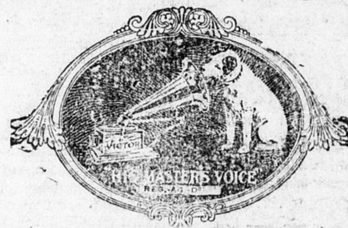
"Look for the trade mark dog on it"

Yard and Warehouse SCHUMACHER Phone 95 B