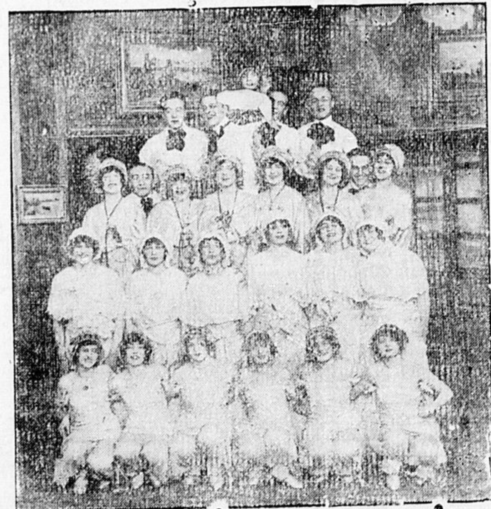
PONY BALLET OF WONDERFUL DANCERS.