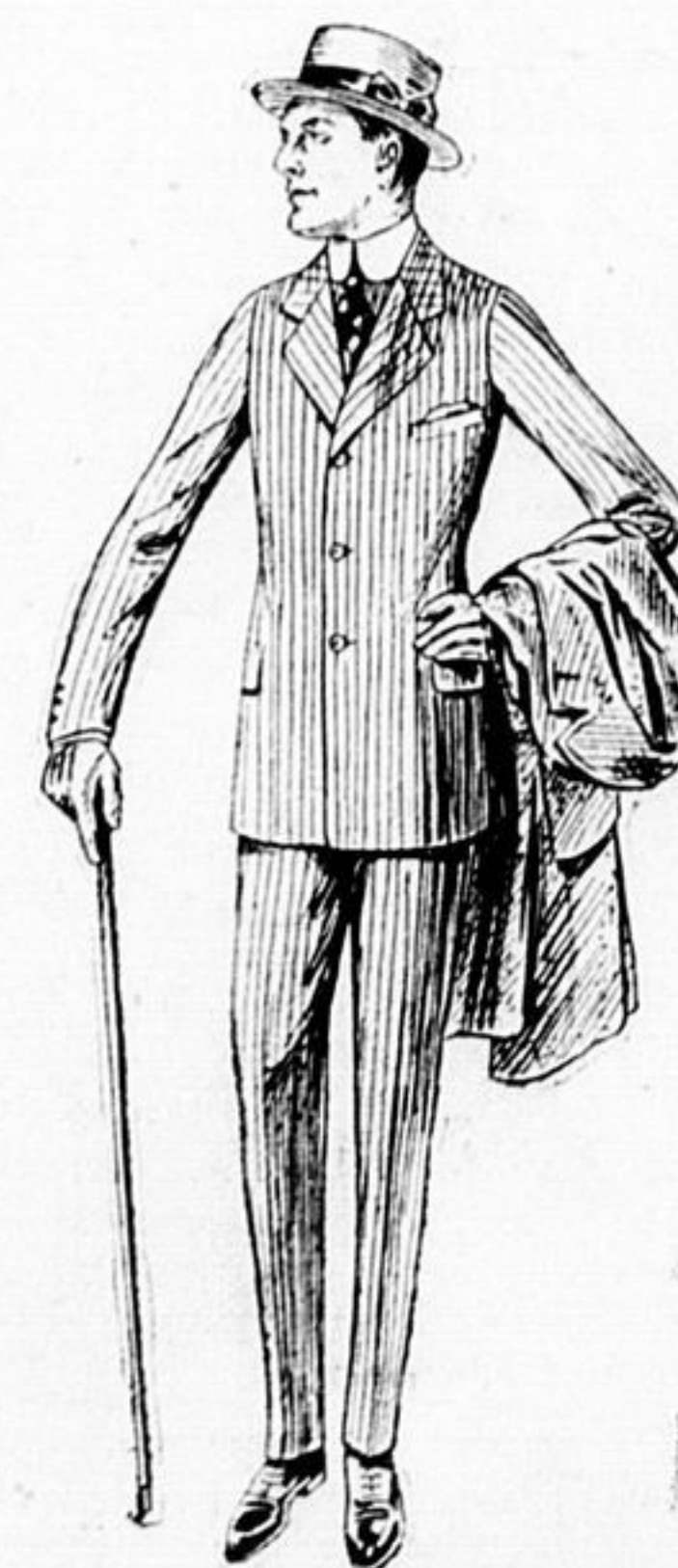
STYLE 918 THREE BUTTON STRAIGHT FRONT