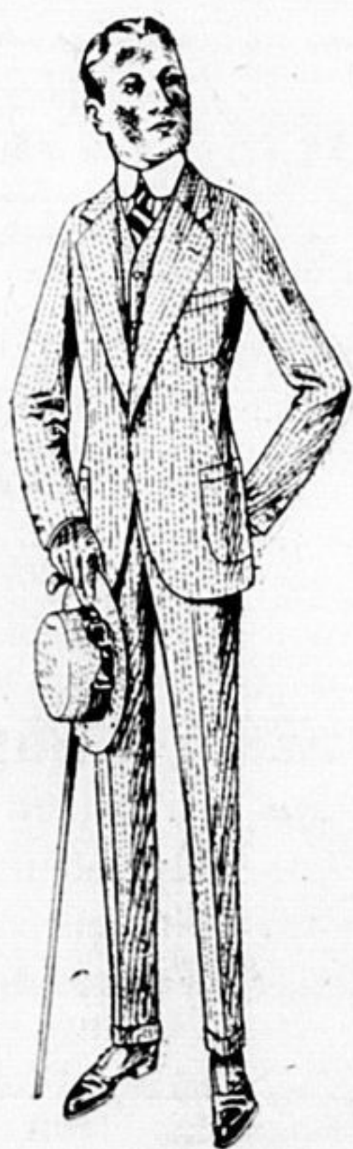
STYLE 907 A NIFTY PATCH POCKET STYLE