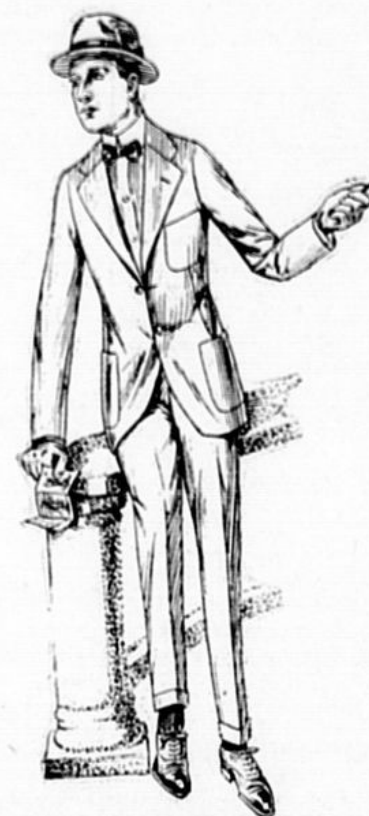
STYLE 920 THREE BUTTONS PATCH POCKETS

Are the acme of perfection in Mens' clothes for particular people. They are cut by hand in the largest and most sanitary tailor shops in Canada, and into every detail enters that great in PRICE and QUALITY which has made the name HOBBERLIN the standard of perfection on which the best dressed men insist