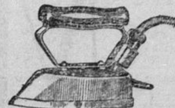
SOVEREIGN ELECTRIC IRONS

Are various in Design and include some very useful sizes. Our Pyrex Casseroles are numerous, and better still, our prices are right.