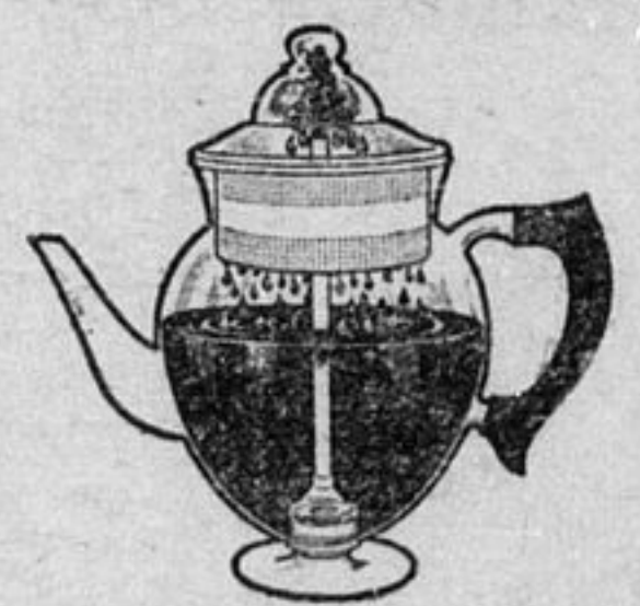
Solid Copper Nickel Plated Tea Pots, Coffee Pots, Percolators, many designs—real practical gifts.

We believe you will like it so well that you'll not want to part with it afterwards.