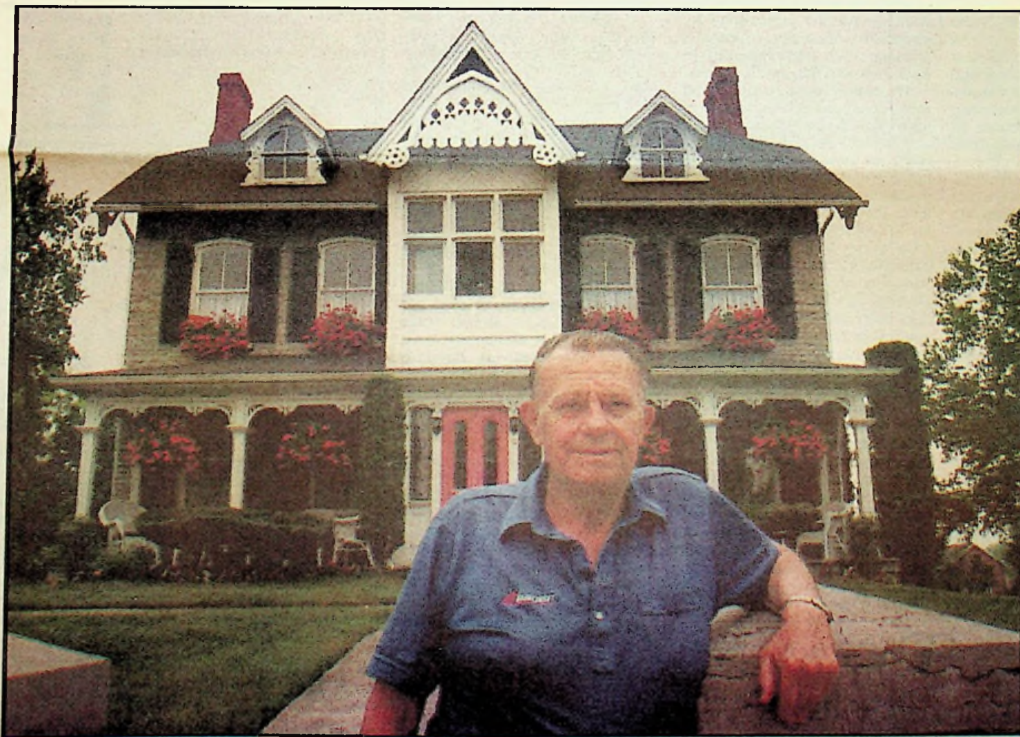
Our Town