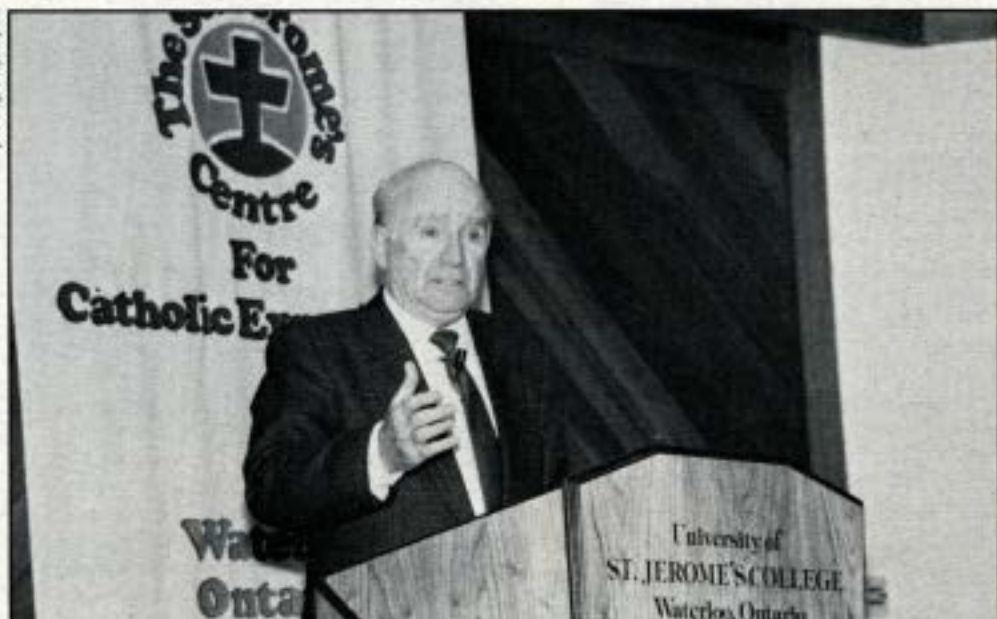
Gérard Pelletier delivers the sixth annual Graduates' Association Lecture.

G érard Pelletier was born in Victoriaville, Quebec in June 1919, one of eight children. He was educated at the Séminaire de Nicolet, Collège Mont-Laurier and the Université de Montréal. From 1939 to 1943 he was General Secretary of Quebec's Jeunesse étudiante catholique, and was Field Secretary of the World Student Relief Organization in Geneva from 1945 to 1947.