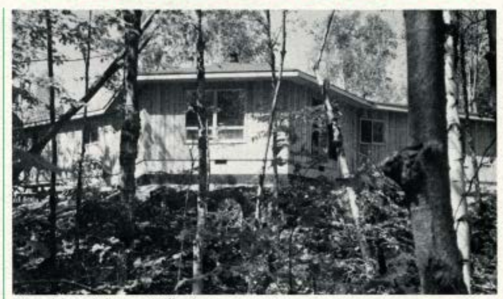
View of the main house at Wellspring