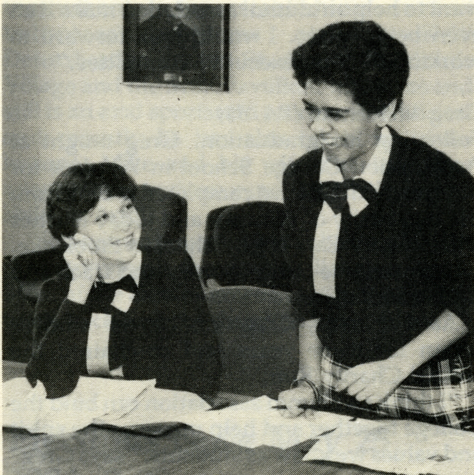
A light moment shared by the St. Mary's High School junior debating team of Kitchener during the Central Western Ontario Regional Debating Finals hosted by the College on February 21.

Over 80 students from nine area high schools debated whether or not "civil disobedience is a justifiable form of protest in a democratic society." Over 50 judges, including College faculty members, also took part in the day.