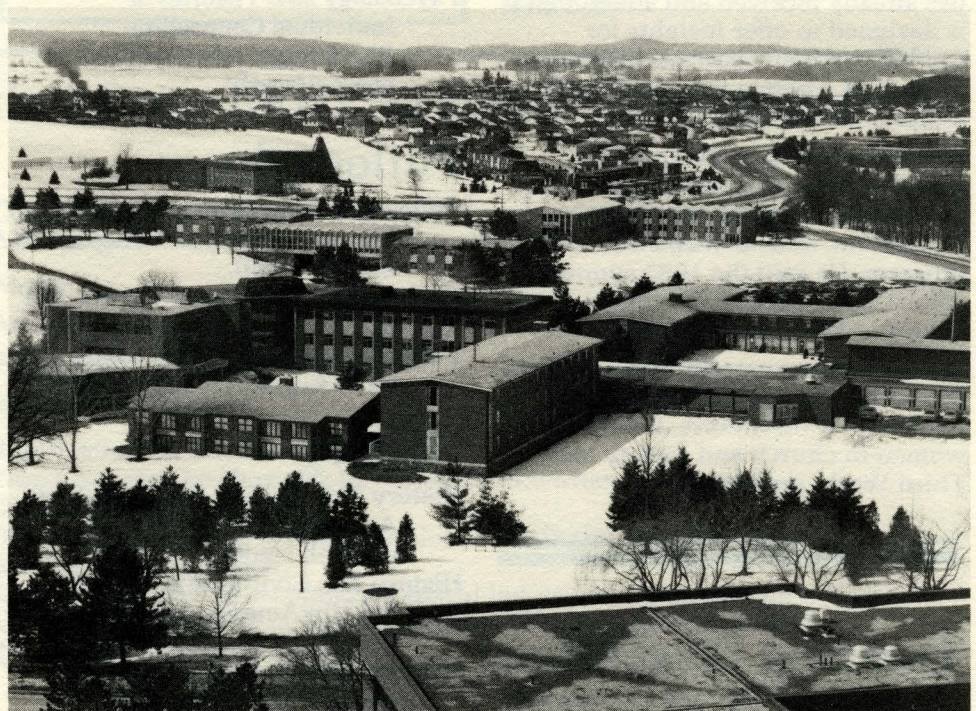
Aerial view of new wing

Alumni Weekend May 29-30 (details inside)