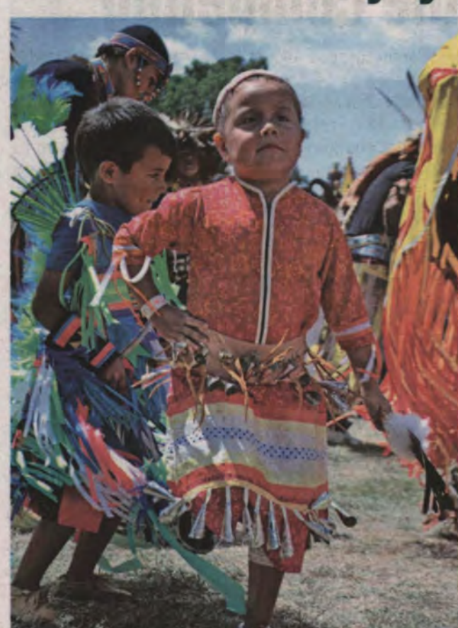
Age is not an issue when its pow wow time!