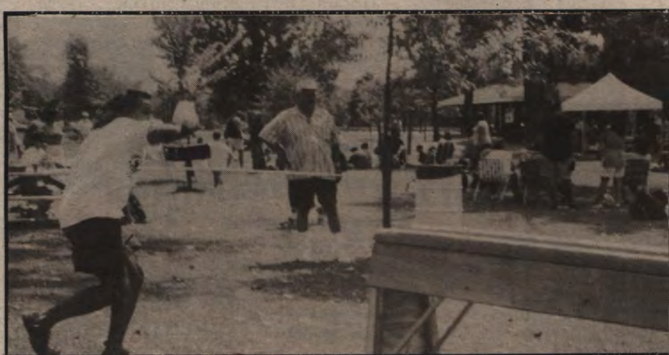
Snowsnakes in summer!