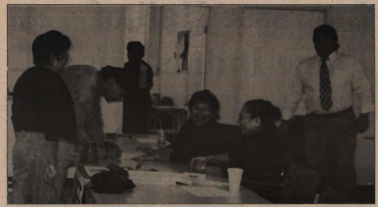
The Six Nations Community Bingo Hall was buzzing with activity Saturday when 41 candidates showed up to be nominated in the 51st general elections and second election to be held under Six Nations "Custom" Election Code.