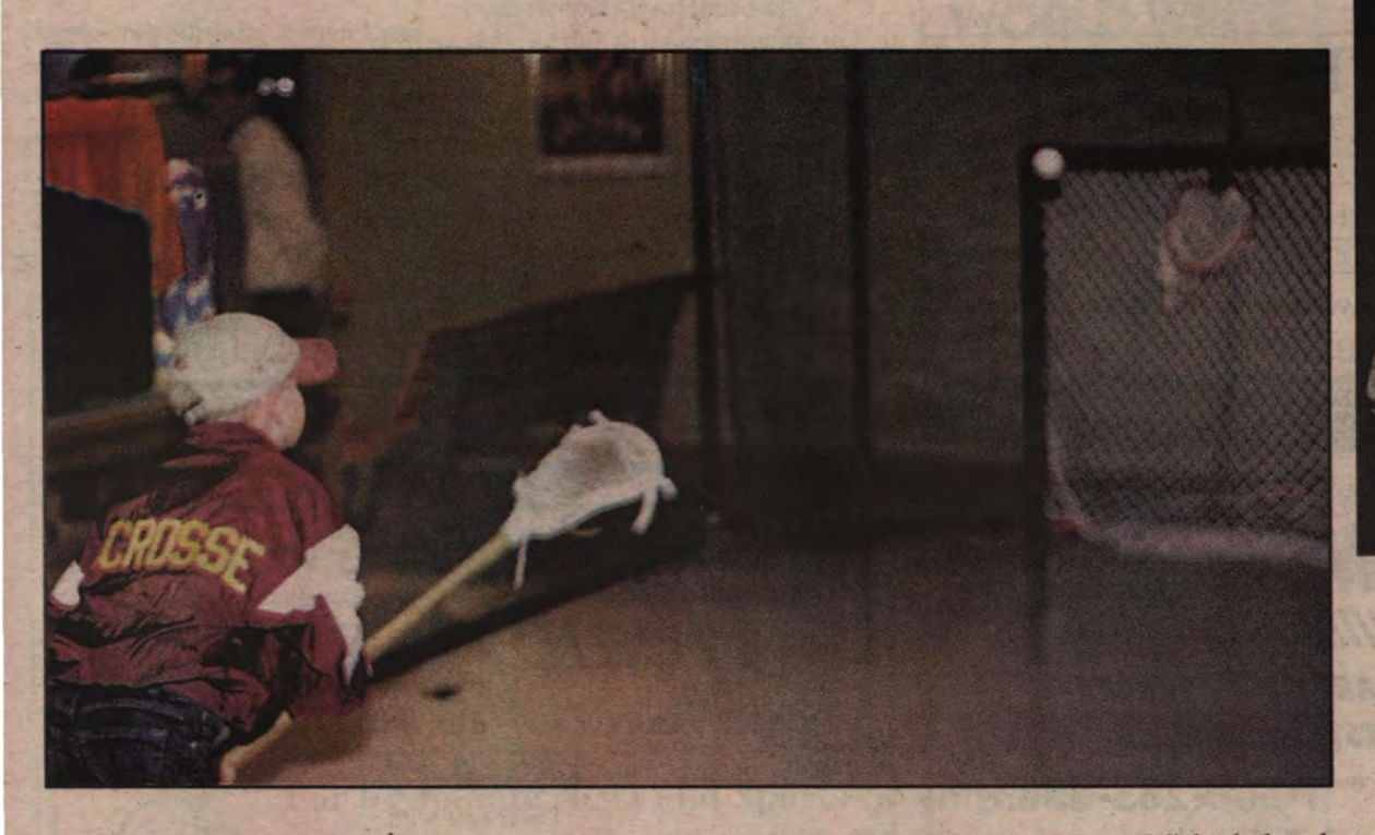
awards banquet later that evening.