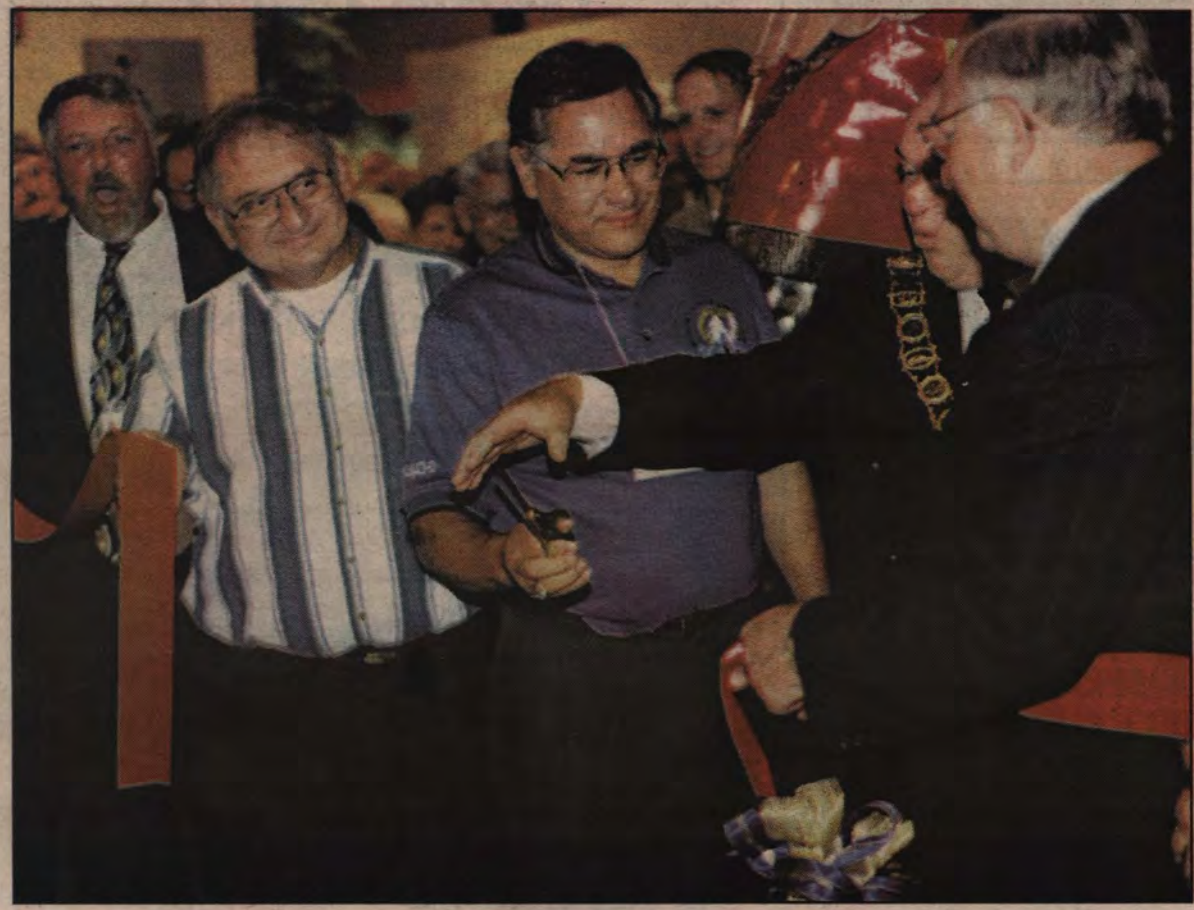
The New Ontario Hall of Fame was declared officially opened with a ribbon cutting ceremony.