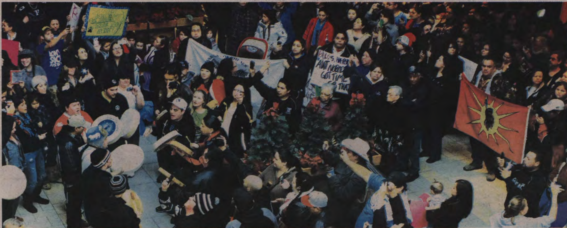
Hundreds took part in a flash mob at Limeridge Mall Christmas Eve.