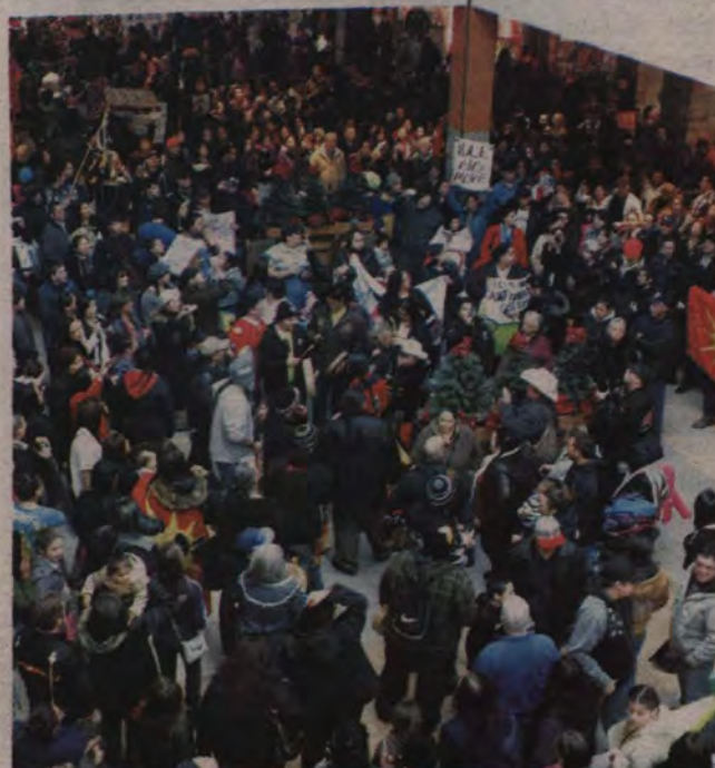
Hundreds gather at the Old Navy entrance for the flash mob round dance.