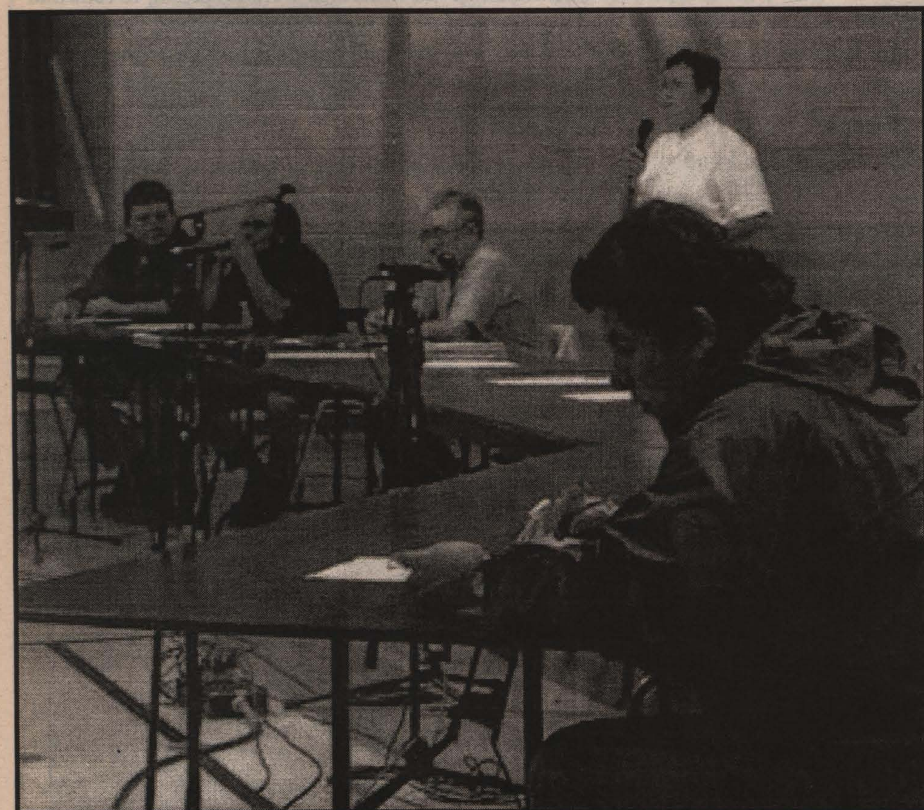
While Thursday's meeting drew close to a hundred community members, only five councillors joined the chief in facing questions relating to Grand River Mills.

She added that the group will also organize a follow-up meeting with council within the next three to four weeks.