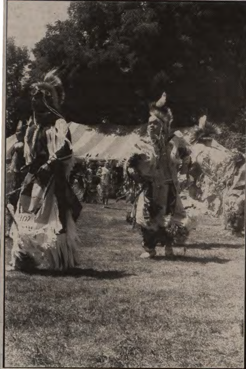
More than 350 dancers from across North America travelled to Six Nations for the 20th annual Champion of Champions Pow Wow.