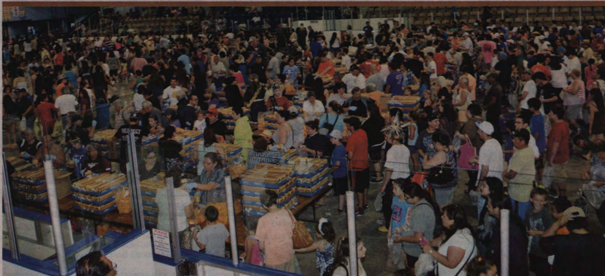
Thousands wound their way around the Six Nations arena and through lines, battling soaring temperatures to receive a chunk of cheese and bread in recognition of Six Nations nationhood and status as "Crown" allies. The over 150 year old tradition has become a tourist attraction attracting people from across Canada.