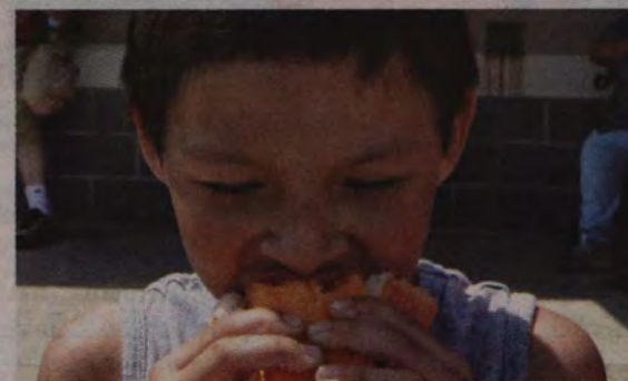
Yum loving that bread and cheese