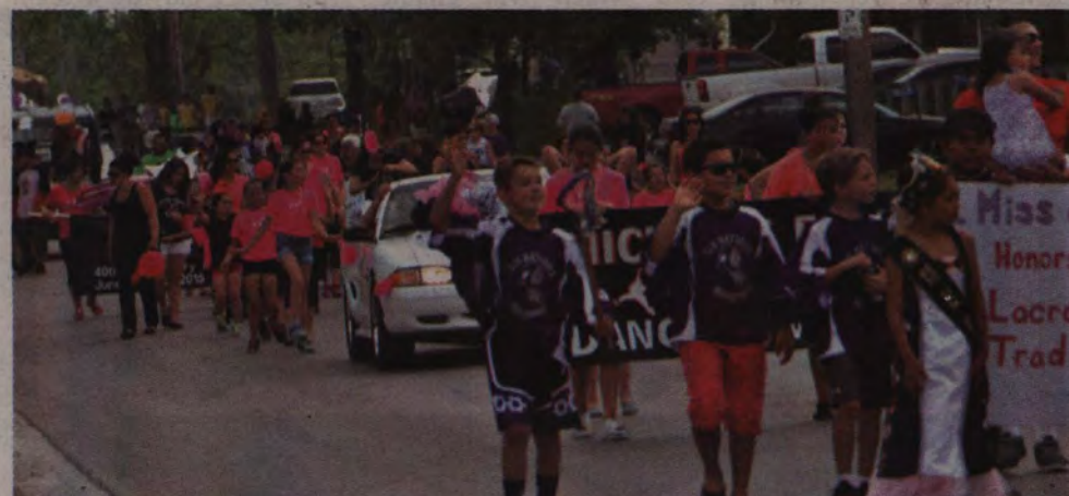
The annual Bread and Cheese Day parade makes its way down Fourth line and into the arena.