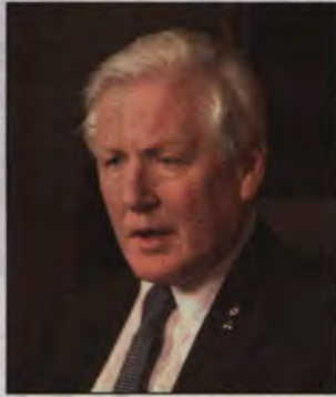
Hon. Robert K. Rae is the new Honourary Patron of the Woodland Cultural Centre's Save The Evidence fundraising campaign.

After the tour on Monday at the Mohawk Institute Indian Residential School building, Rae was announced the Honourary Patron of the Woodland Cultural Centre's Save The Evidence fundraising campaign — a campaign raising necessary funds for repairs and renovations of the school to ensure the