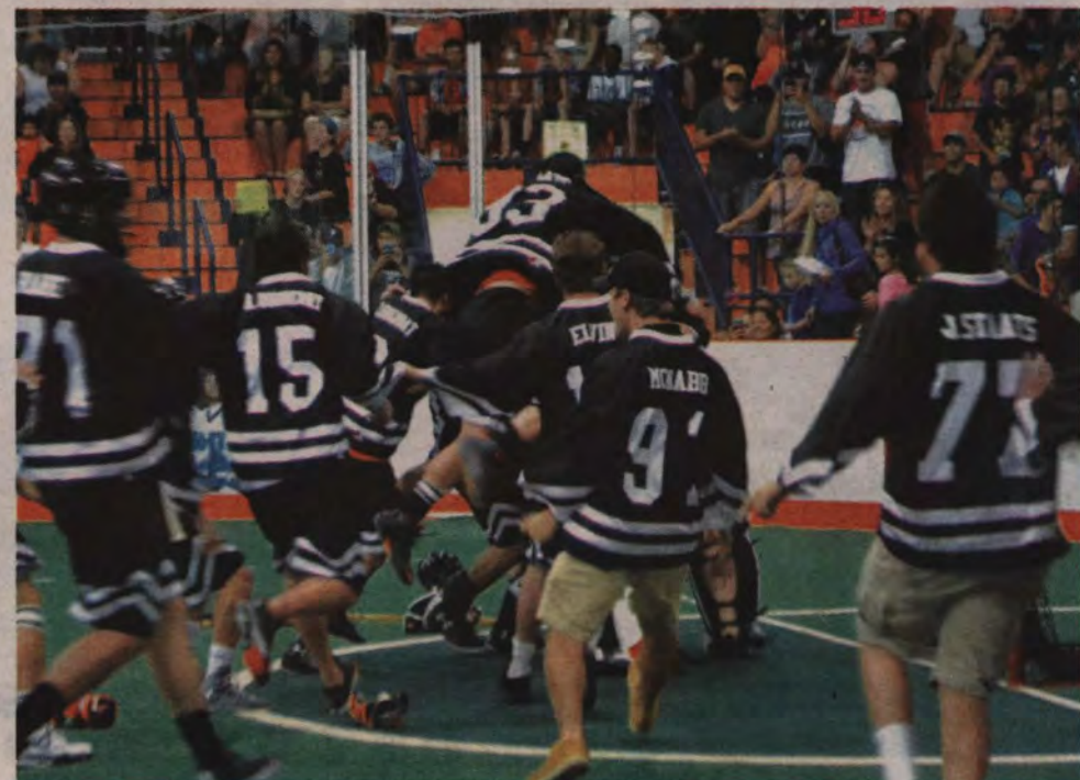
That regulation time clock couldn't count down fast enough for the Six Nations Arrows as they enthusiastically celebrate moments after clinching a second straight Minto Cup.

17 points in Minto Cup action and was named MVP said. "We've all played this 1,000 times in our backyard or at least I definitely