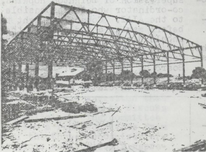
Completion of Structural Steel of Six Nations Arena, Ohsweken August 1, 1972.