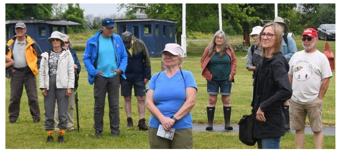
Part of the group who gathered at the Marine Museum in South Bay ready to explore The South Shore Footpath Project