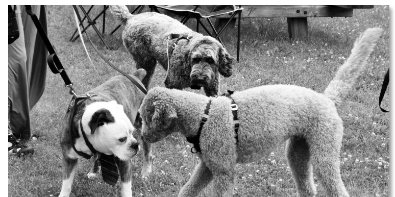
The South Marysburgh Recreative Committee held its "Meet and Greet" Community Picnic on June 16 at the Milford Fair Grounds. The rec committee provided a summer kick-off of hot dogs, hamburgers and ice cream. Even the canine neighbours got to meet and greet.