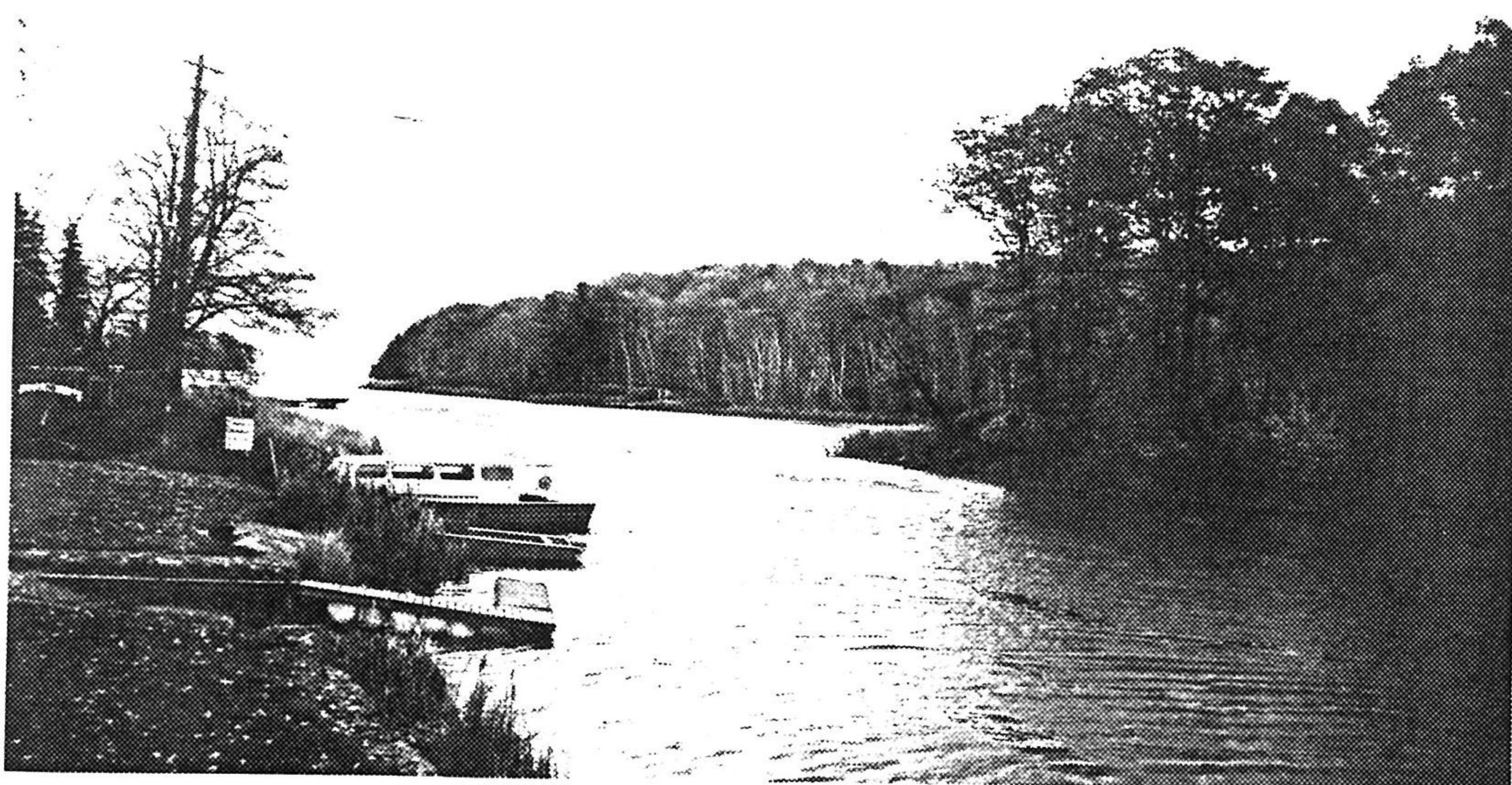
Black River looking east toward it's mouth