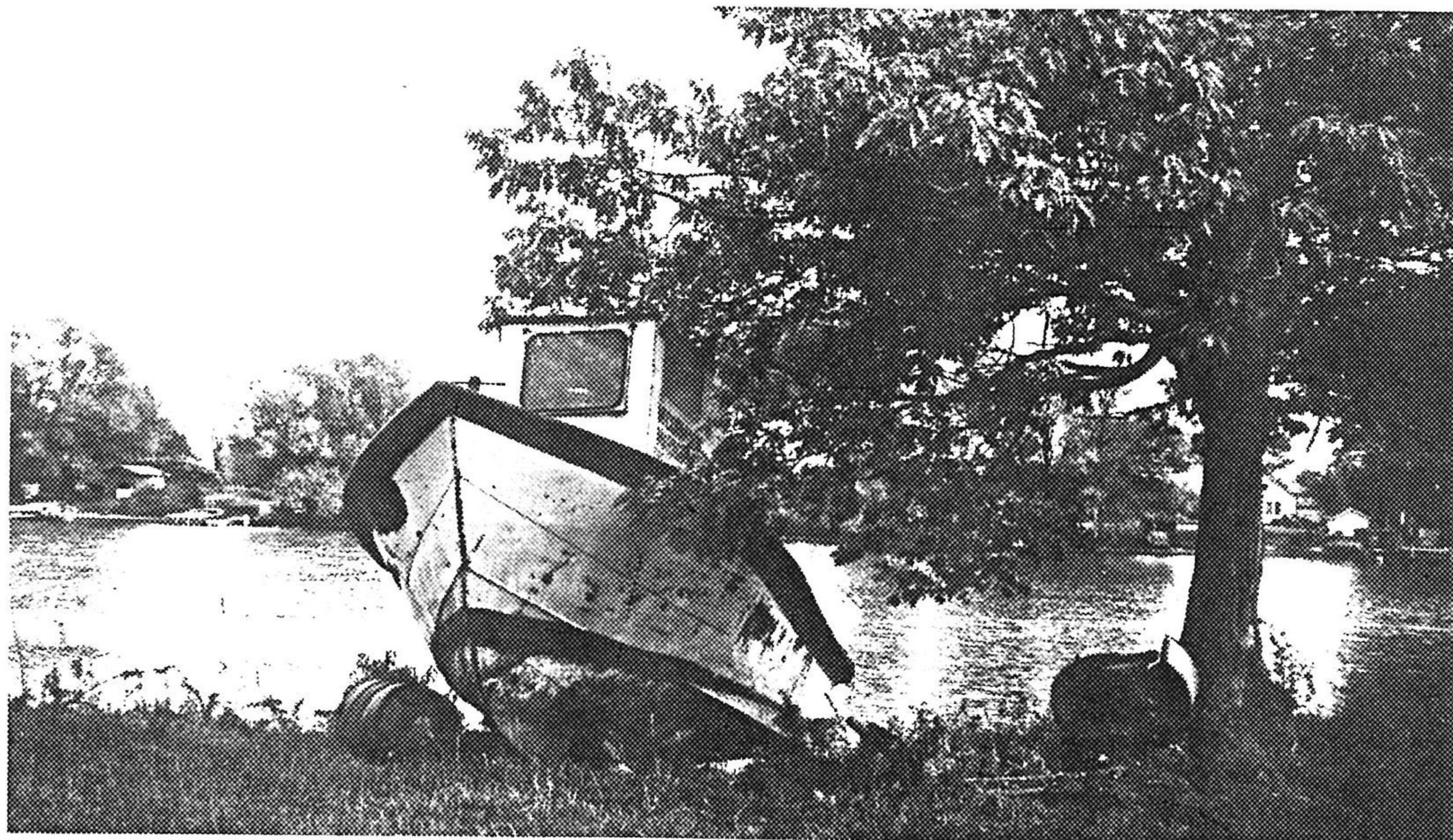
An old fishing boat rests on the bank at Point Traverse