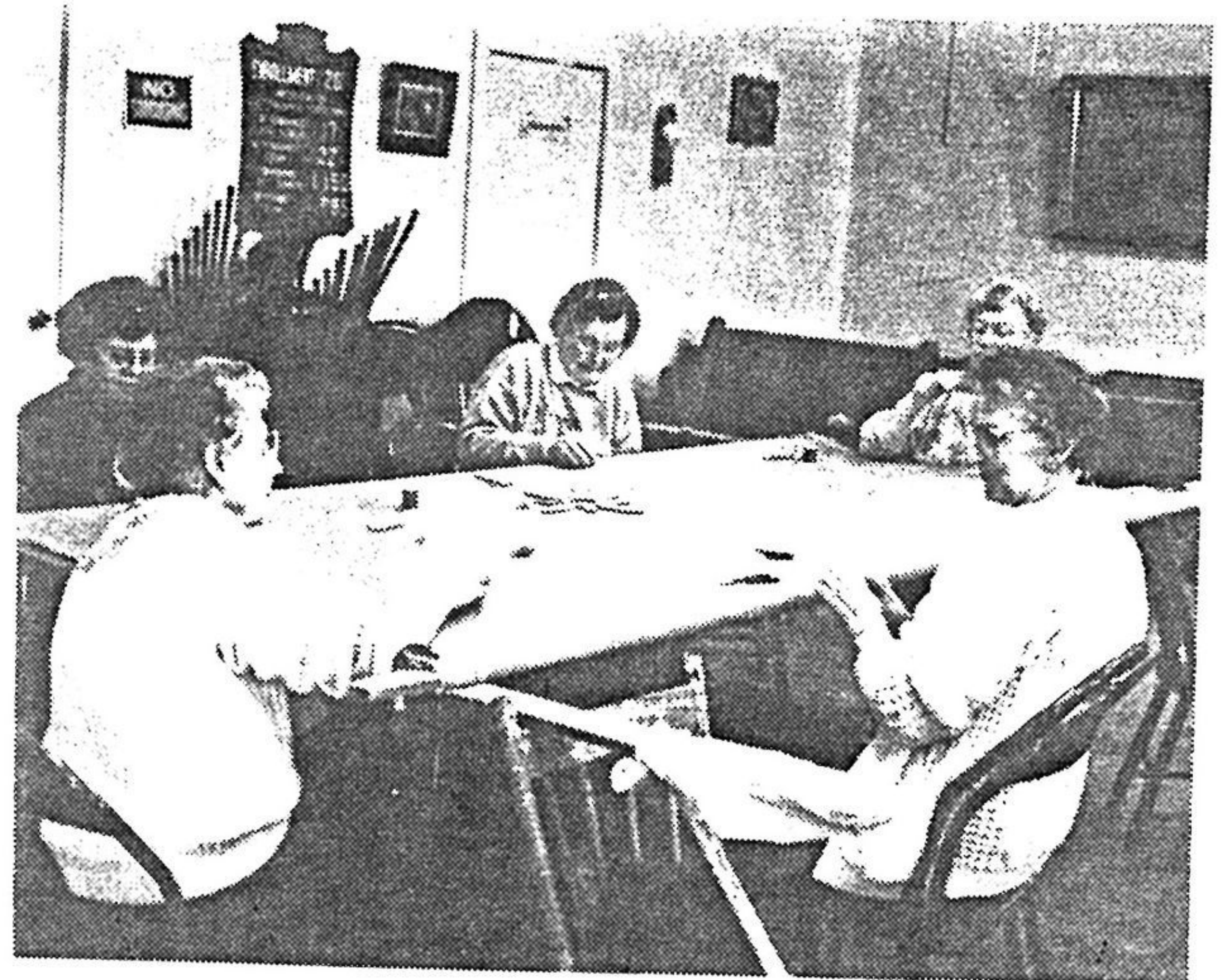
Present day Long Point Ladies continue the tradition, as they quilt a plain topped quilt.

The Policy Advisory Committee is now in the last stage of its work, and is in the process of completing its final report, and so the conservation strategy, for recommendations to the Minister at the end of March. PAC has relied heavily on the advice it received from the public, as well as from its scientific and resource management advisory groups.