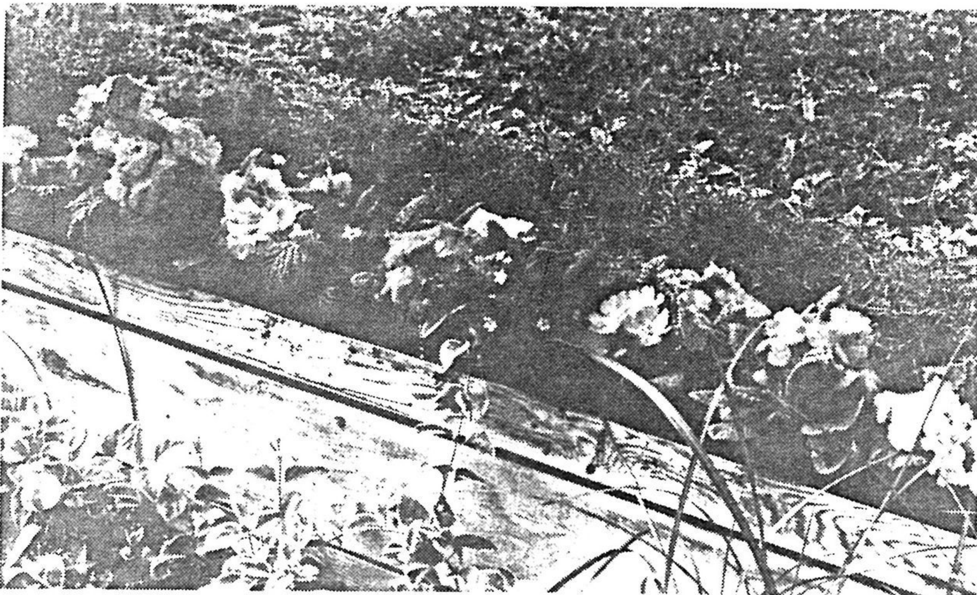
Primroses at Walker's Greenhouse