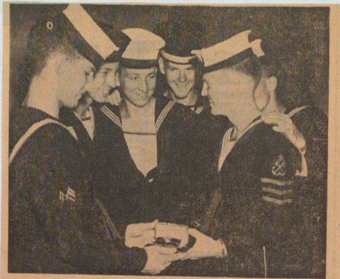
In 1945 He Got It . . .