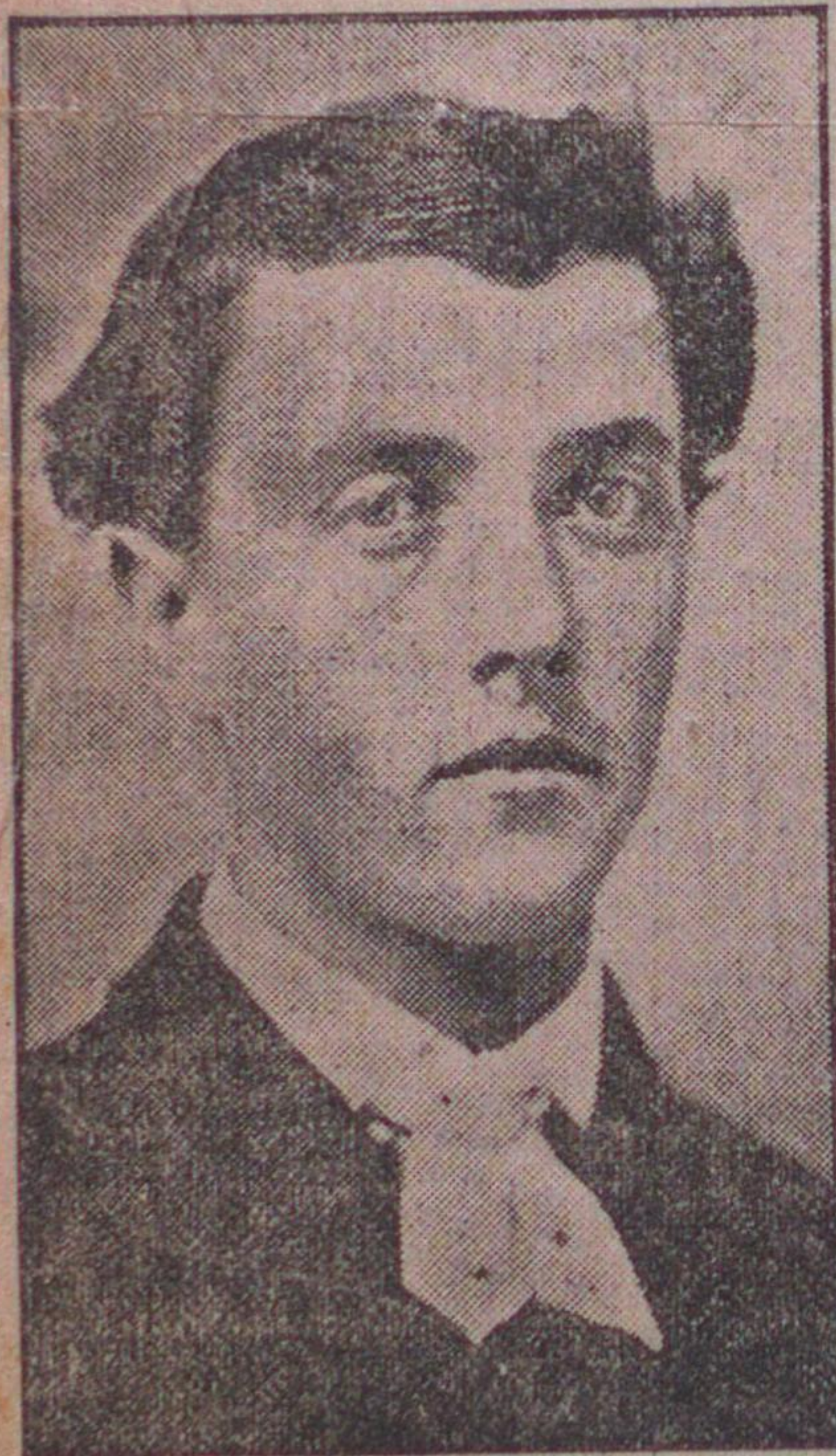
He was a good looking youngster when he began his career as a telegraph operator.