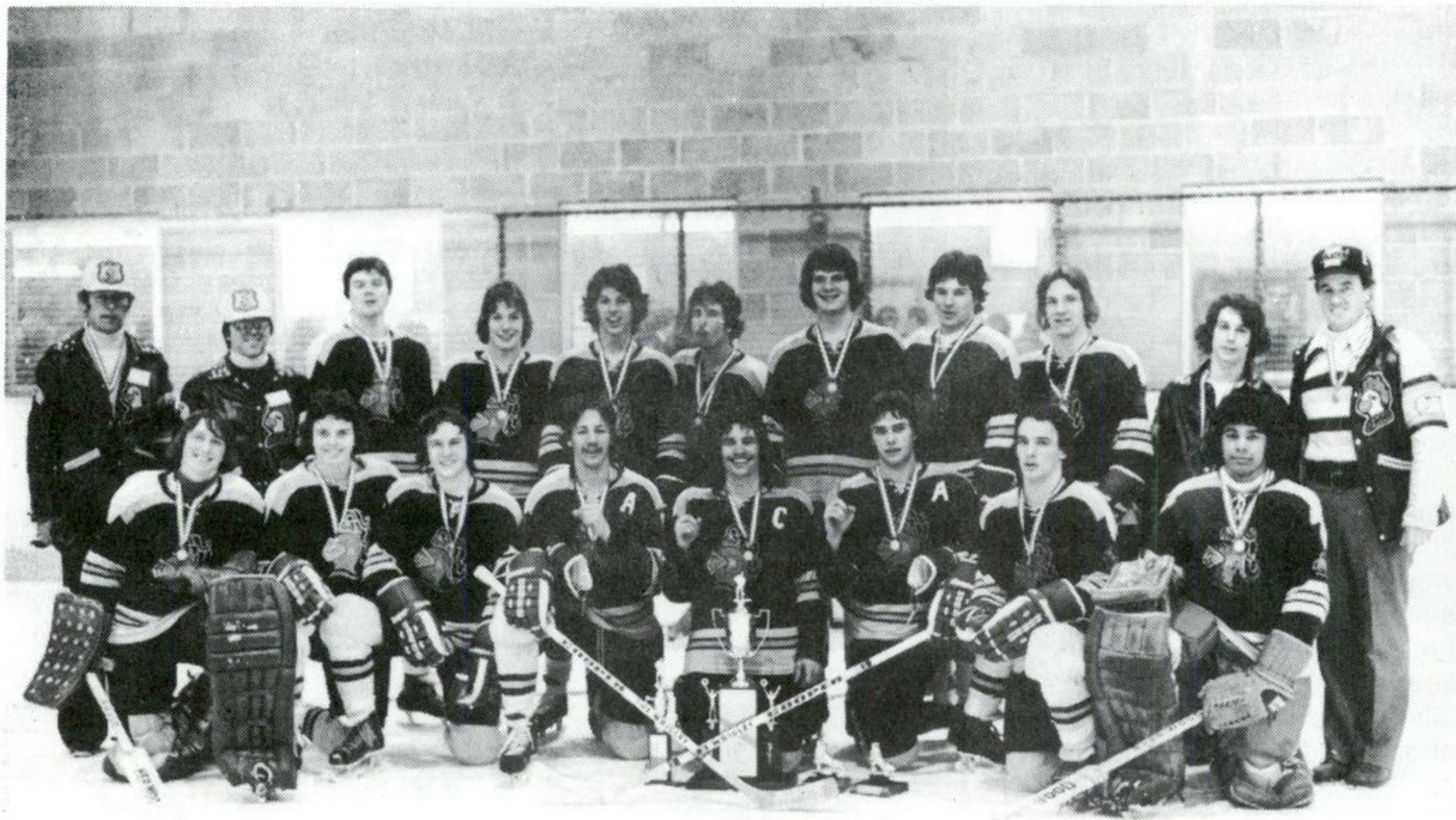
The Ottawa West Golden Knights won the Lion Hockey Tournament. A Trophy in Russell's First Annual Midget A