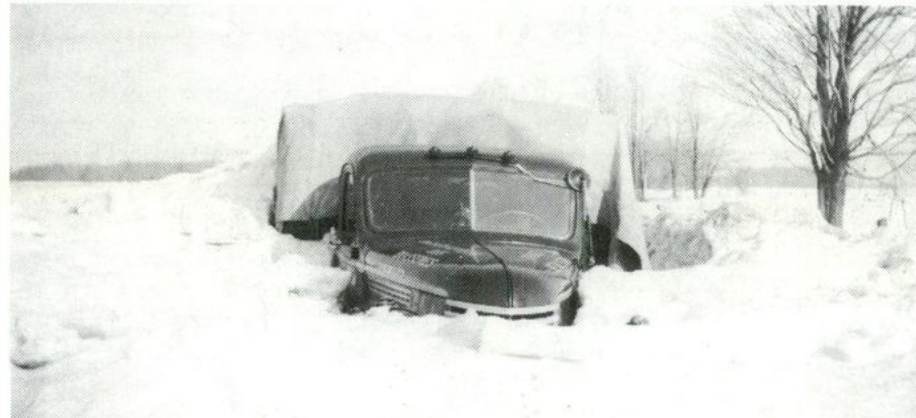
NOSTALGIA — If you think we've had a bad winter, just look at these shots from 1938. Maybe we haven't had it so bad after all.

ations Magnetic Signs Office Supplies Rubber Stamps CU eastern Wedding Invitations Magnetic Signs Offi ontario s CUSTOM PRINTING Wedding graphics s Office Supplies Rubber Stamps ltd. edding Invitations Magnetic Signs ampS CUSTOM PRINTING Wed ampS CUSTOM PRINTING Wedding Invitations Magnetic Signs Office Supplies Rubber Stamps CUSTOM PRINTI NG Wedding Invitations Magnetic Signs Office Supplies R ubber Stamps CUSTOM PRINTING Wedding Invitations Magnetic Signs Office Supplies Rubb PRINTING Wedding Invitations Mag pplies Rubber Stamps CUSTOM PRI Tel. 448-2137 M Hwy. 43 By-pass Su CHESTERVILLE, ONT. vi