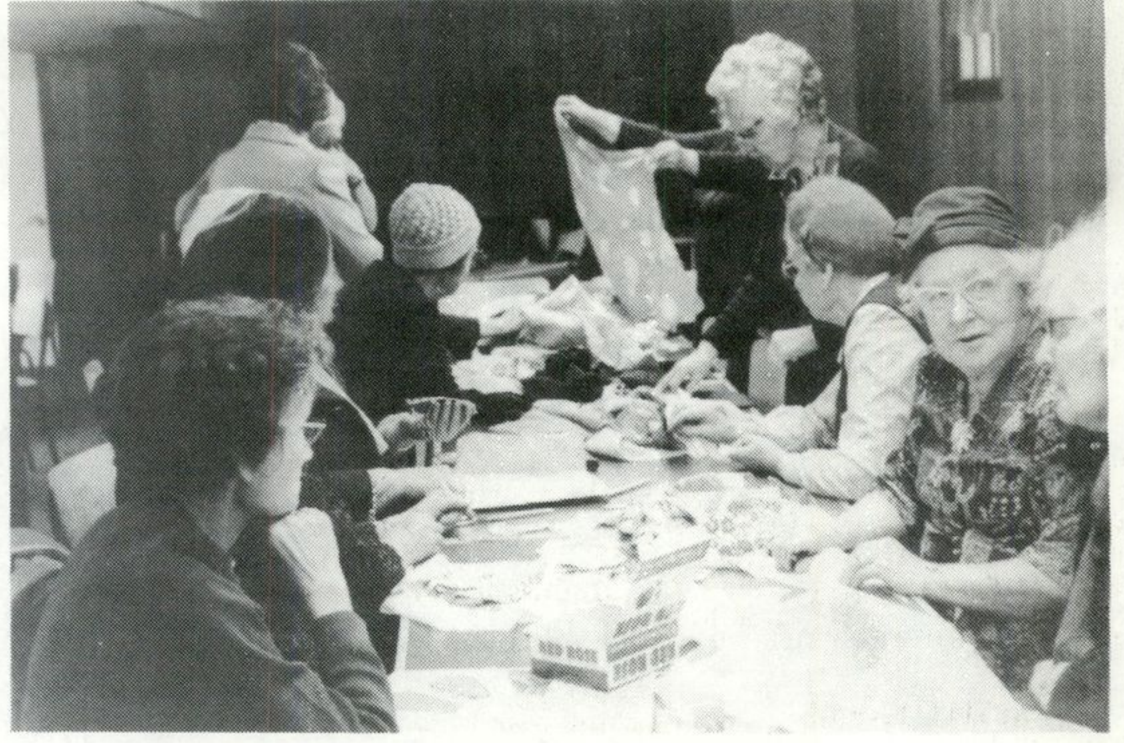
At the Senior Citizen's "Drop in," Centre a Christmas Party was held. They entertained a group from Osgoode and Morewood who helped to celebrate the first year's activities. The Russell Boaters were busy as well as successful with Weekly Card parties, enjoyable Bus and Boat Trips and an outstanding Bazaar and Tea.