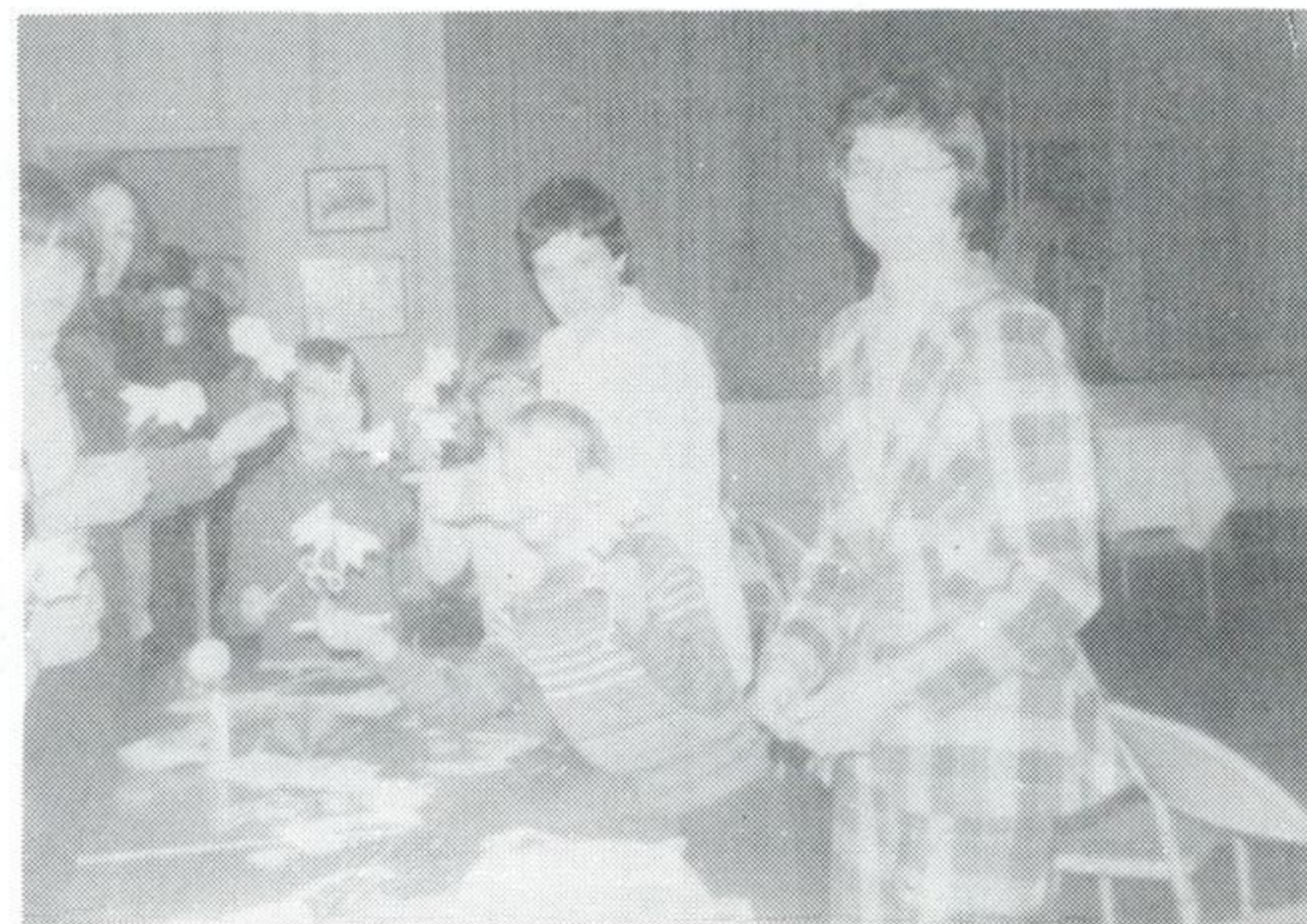
Middle group seen displaying their Easter Lilies, made during craft time at our family service April 4, 1976.