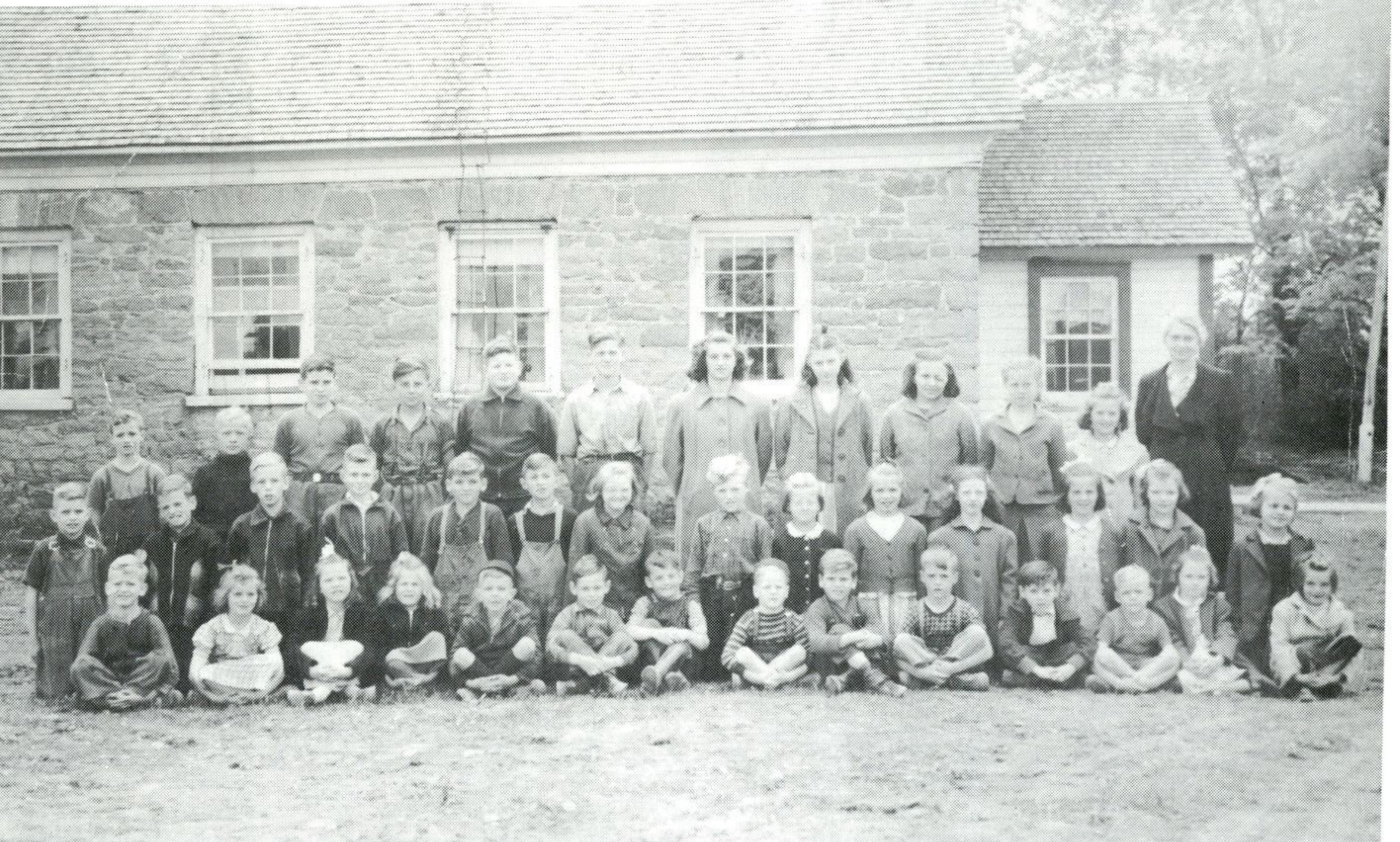
This old school photo (1949 or 1950) shows several Russell residents in their earlier days. Can you name the school? Recognize anyone?