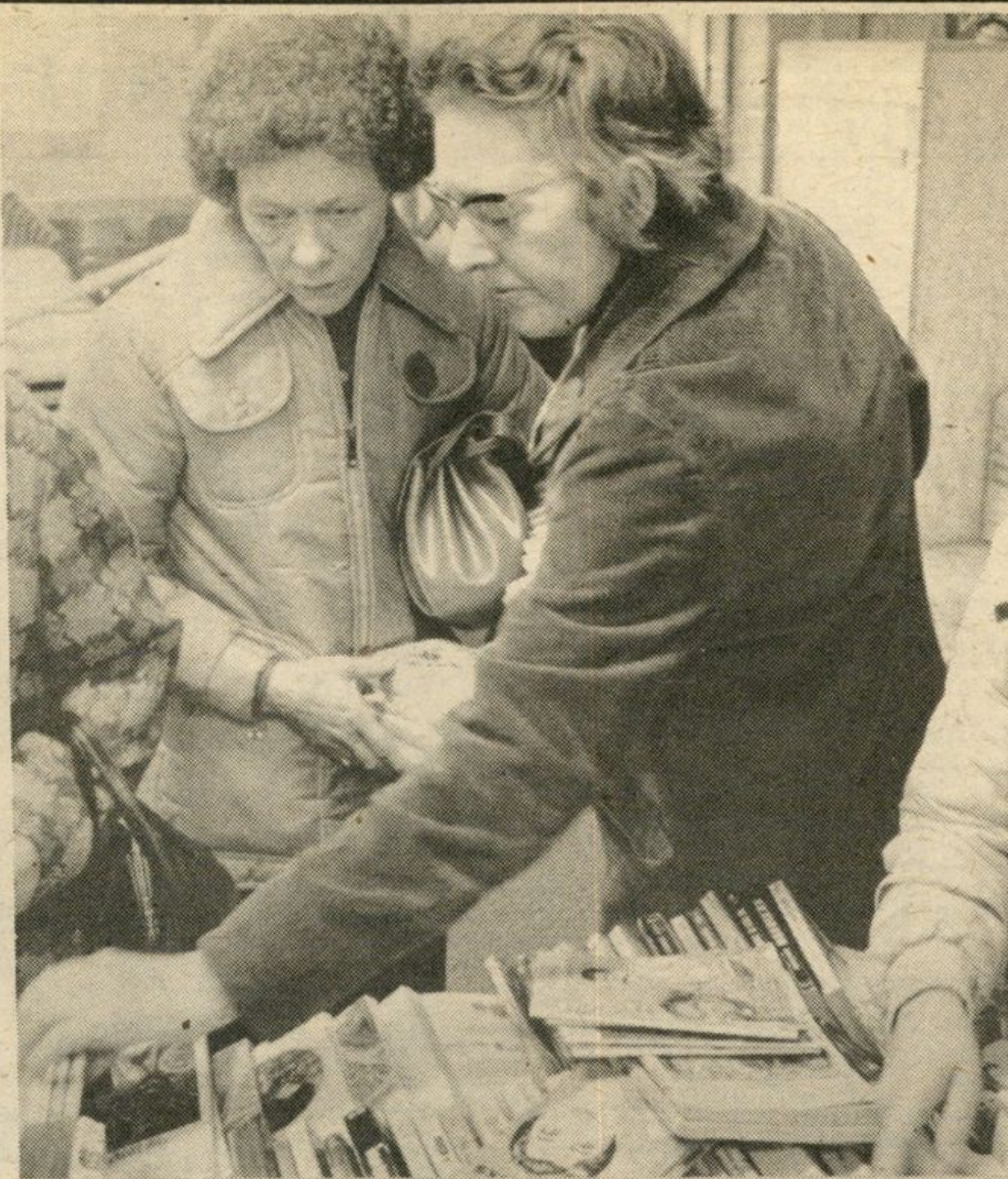
November is Bazaar month and the Catholic Church's affair (above) kicked off the season — on the same Saturday that Bazaars were held in Morewood and Metcalfe. But there are still more to come — see Castor Calendar on page 16.