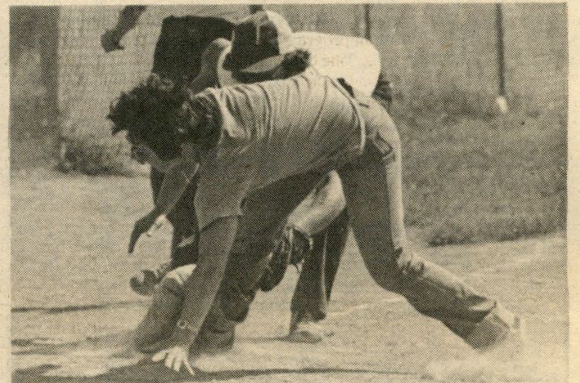
LOB BALL TOURNAMENT AT RUSSELL

The Executive of the Metcalfe Figure Skating Club has been working hard during the summer months in preparation for the new season. Before the skating season gets underway they will be involved in fund raising events. The first of these will take place during the Metcalfe Fair on 3, 4, and 5 October where they will be operating a Craft Booth. This will be an excellent opportunity for area people to begin their Christmas shopping. As well Club crests will be on sale for $2.00. Area skaters are reminded that registration will take place on Sept. 16 and 18 from 7 - 8:30 at the Metcalfe Community Centre.