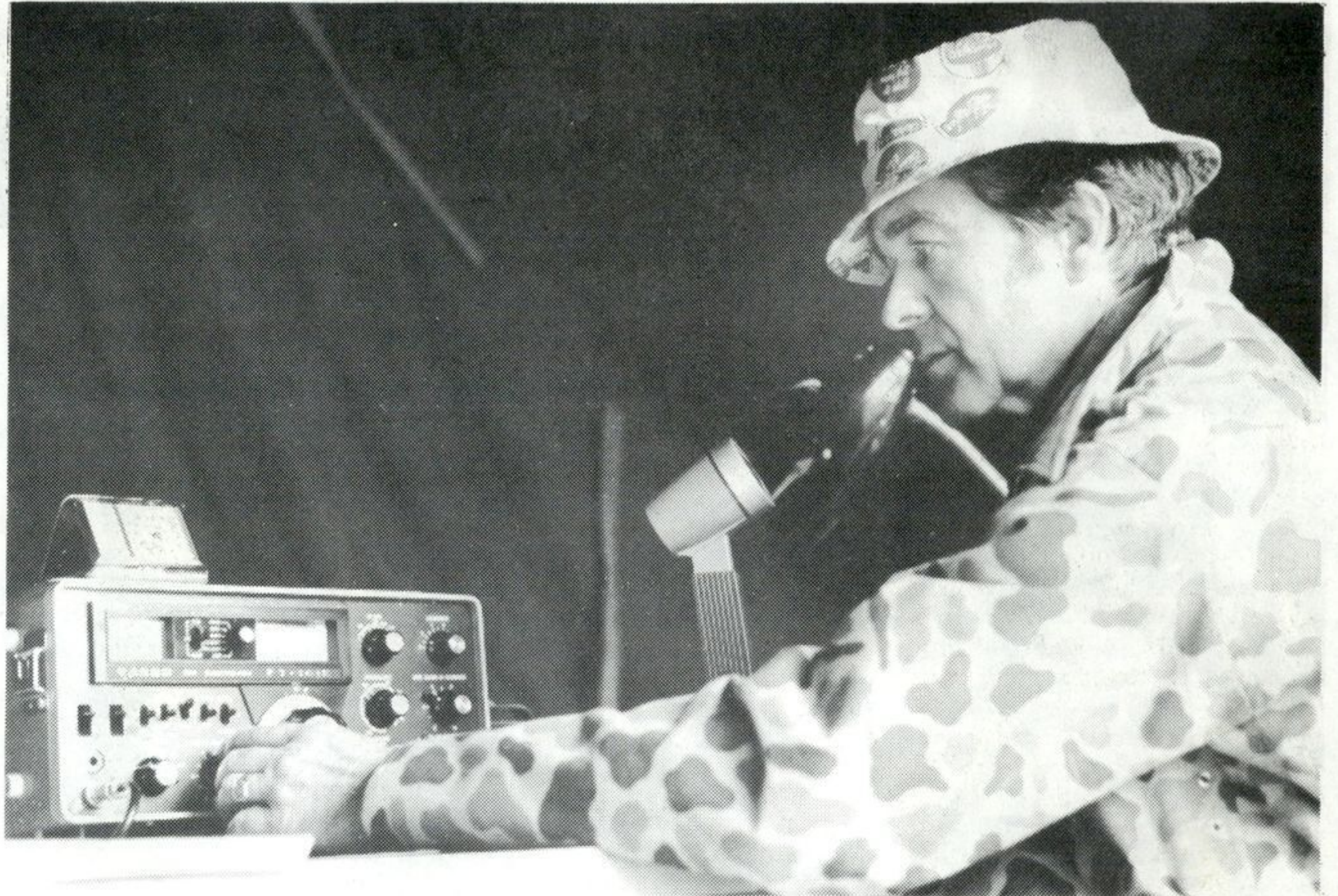
HAM AT THE READY

Charlie was becoming quite brave and seemed intent on exploring the back part of the car as we approached Russell. You can guess who was the first one out of the car as our trip ended. That night we left the car doors open, but we don't know if Charlie took the hint or not. If, (spare the thought) he should rear his ugly head again, does anyone know how to get a chameleon out of a car?