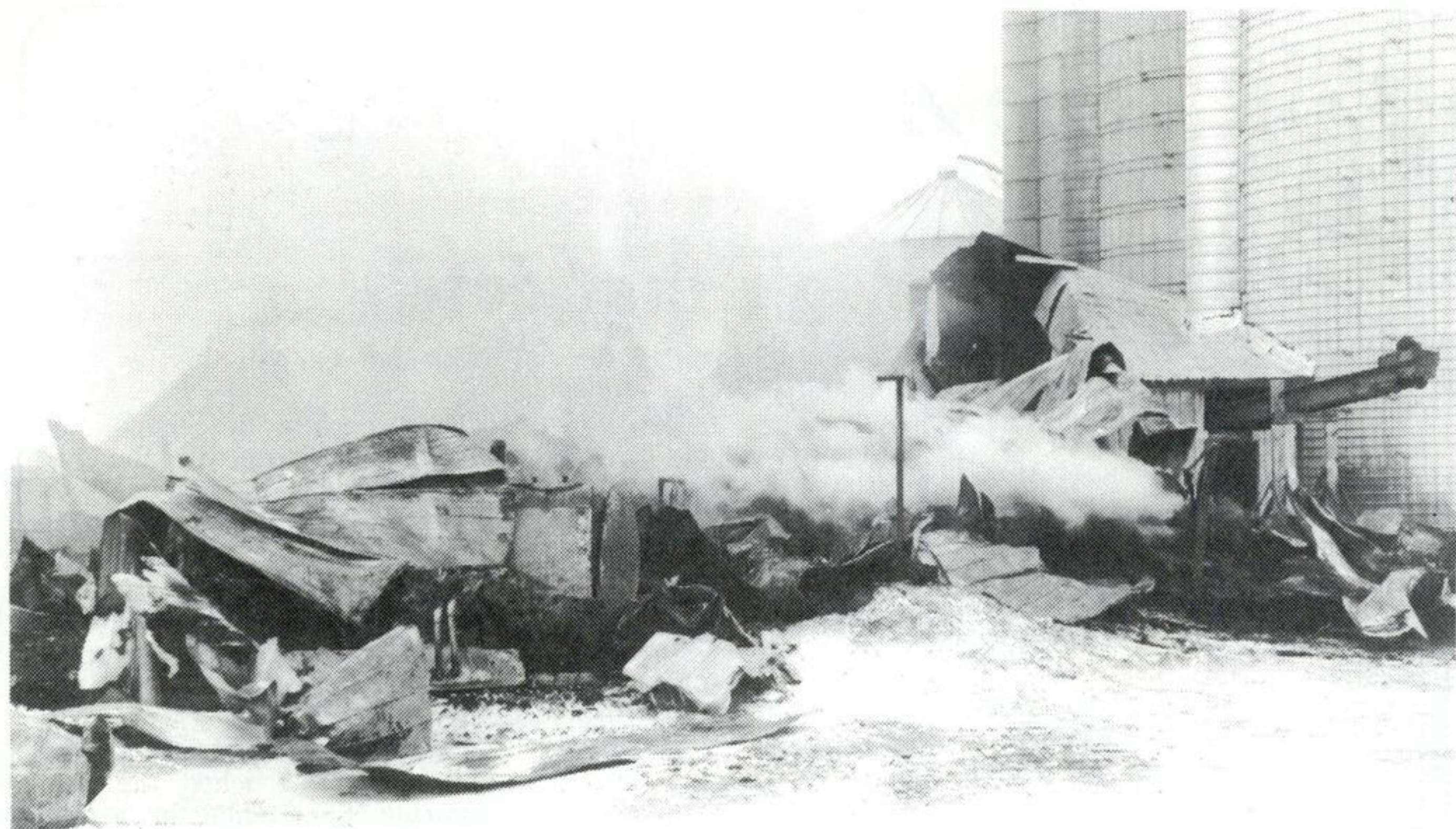
Barn Burned — $150,000

This heap of rubble is all that is left of a barn that was destroyed by fire along the Vars Road, five kilometres west of Embrun last month. The loss, including more than 100 head of cattle and hay, was estimated at more than $150,000. Embrun Fire Chief Maurice Gregoire said that more than 20