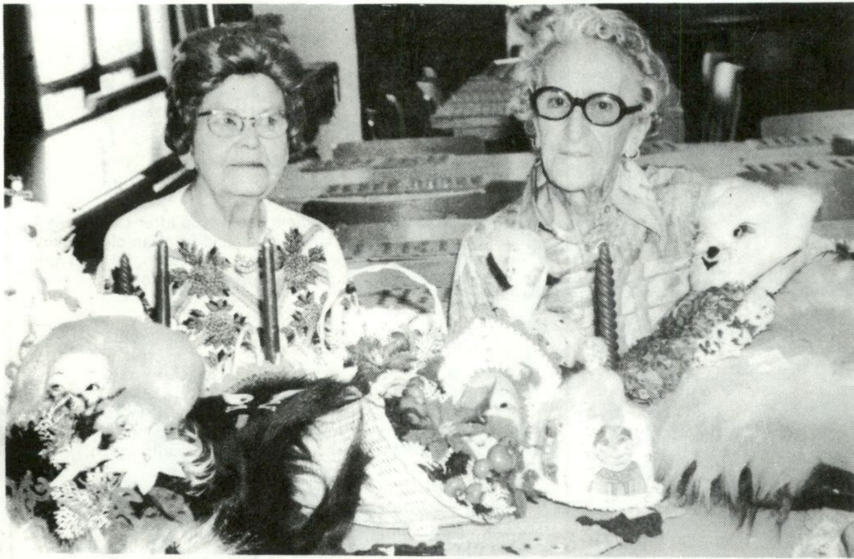
COMPETITION FOR SANTA!