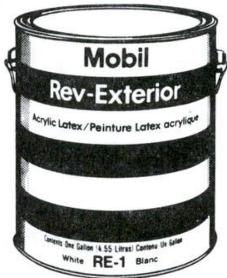
Rev-Exterior, exterior acrylic latex

SUGGESTED RETAIL PRICE $16.75 ON SALE $11.95* gal.