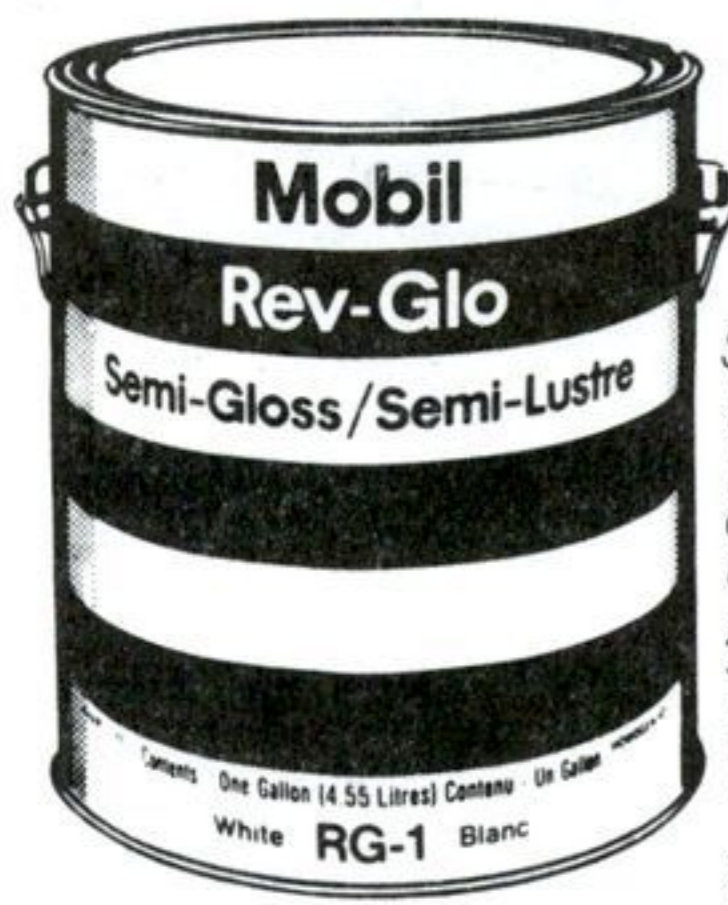
Rev-glo, interior alkyd semi-gloss

Semi-gloss interior paint remains the most popular one! It gives you the most perfect harmony of lustrous beauty and durability, even after repeated washings. And a real saving too.