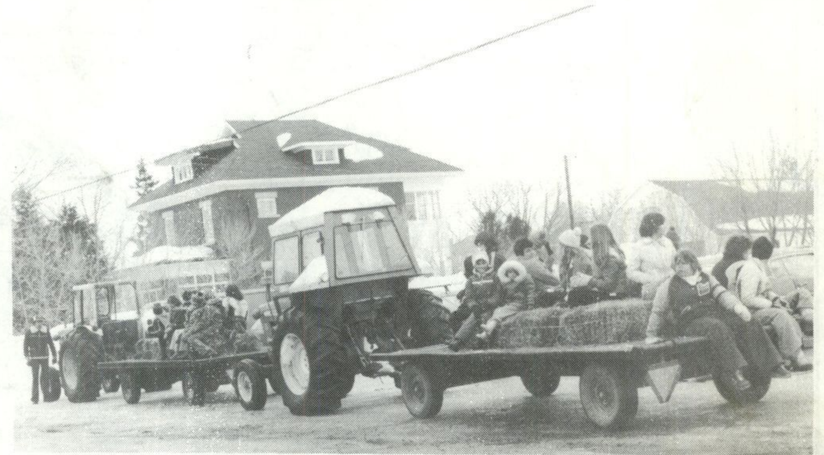
Hayride: These children couldn't wait to climb aboard these trailers stacked with hay in anticipation of a good time. It was all part of the fun at the Russell Inter Carnival.