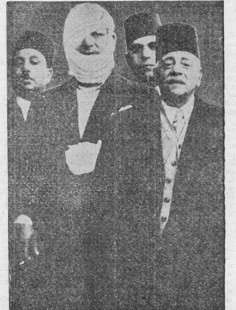
There were many casualties in the Egyptian elections. Here you see the Wafdist (Nahas party) deputy from Damietta, bandaged heavily after receiving rough treatment following an electoral speech. On the right is Hon. Mohammed Bassiouny, president of the Senate.