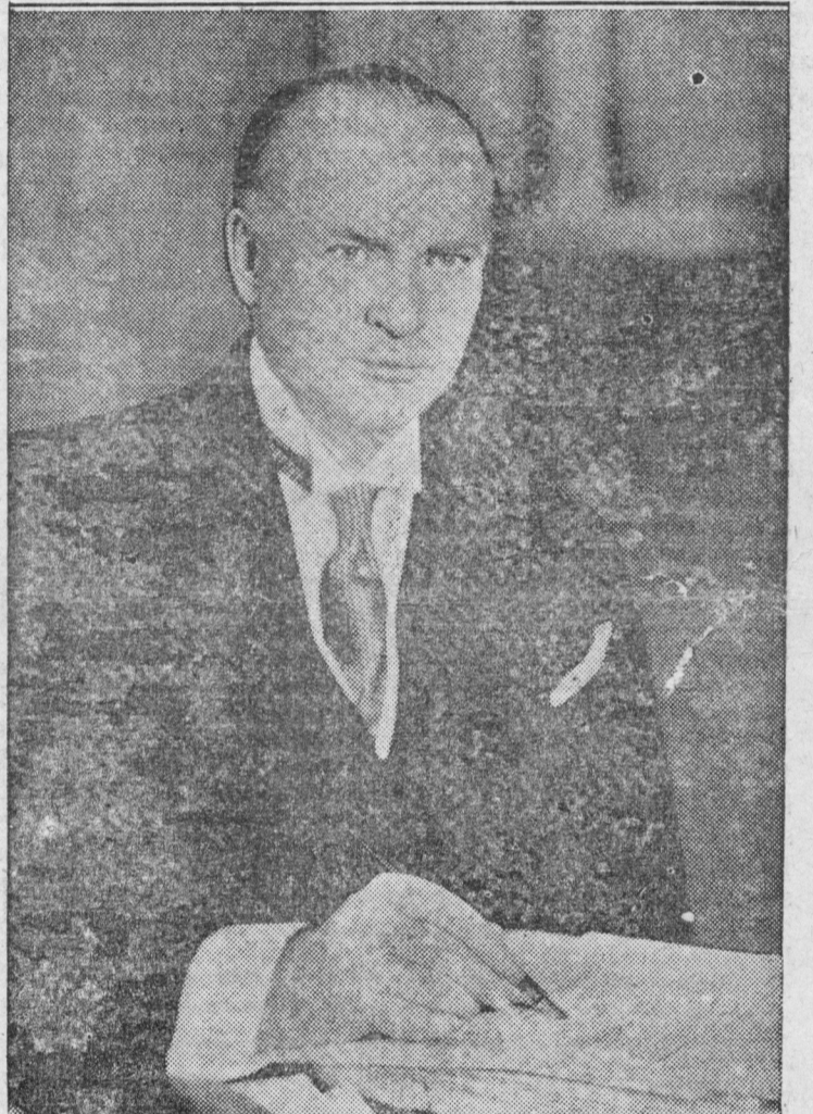
A recent photo of Rt. Hon. R. B. Bennett who resigned the leadership of the Conservative Party.