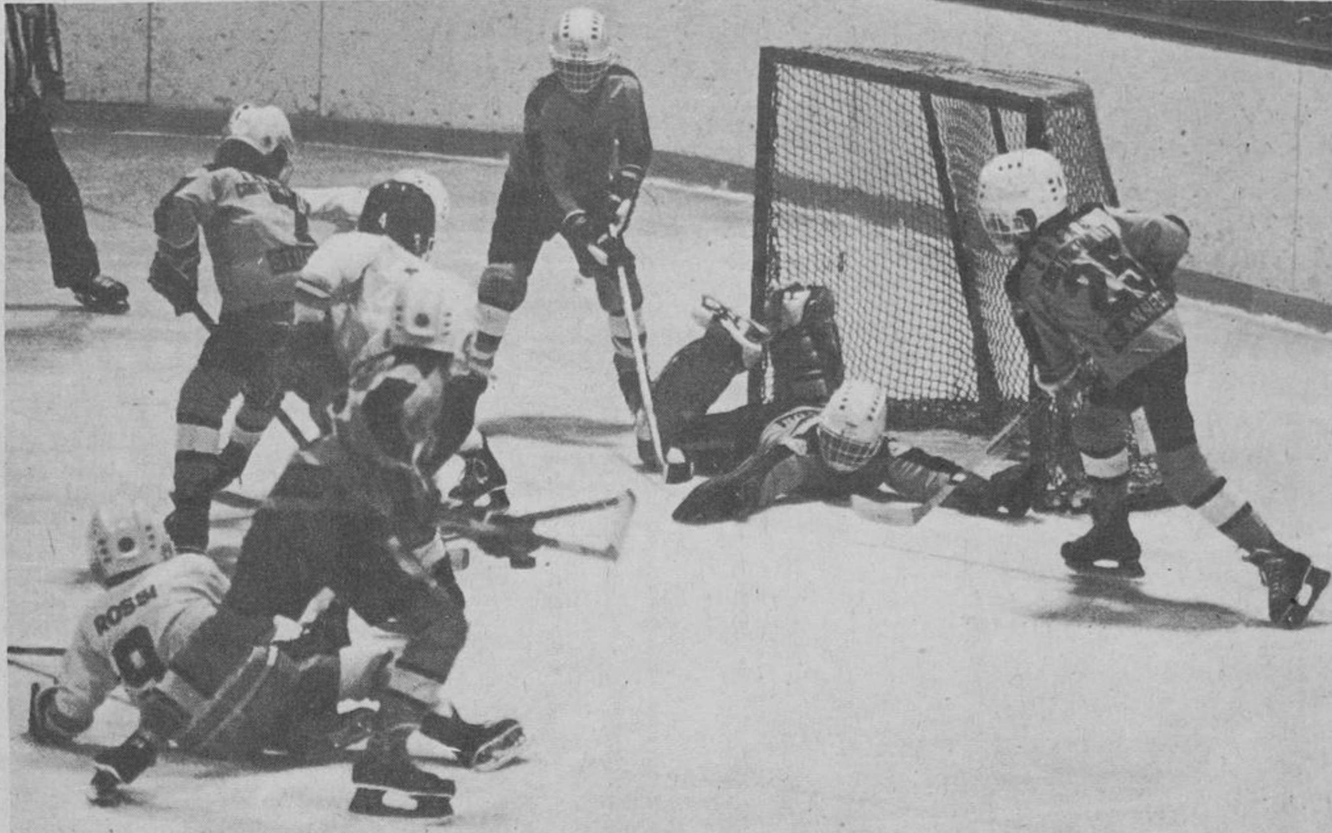
It's scrambles-ville here as the Oak Ridges Little Kings swarm around the Stroud net in Saturday's Christmas Cracker Atom Tournament at Bond Lake Arena. Stroud won this game 5-0 but the Little Kings bounced back to win the consolation championship.