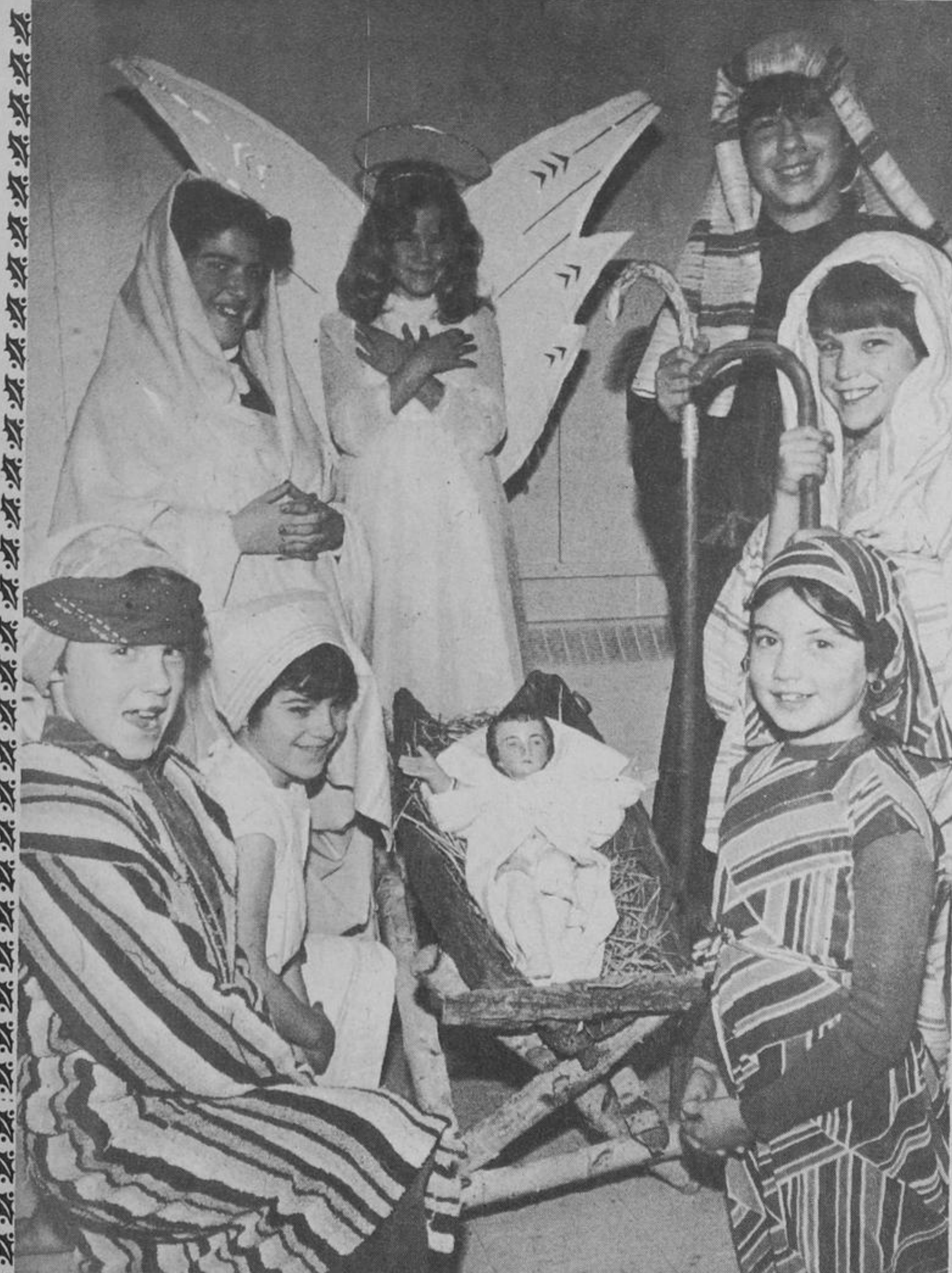
Children at Our Lady of the Annunciation School in Oak Ridges are presenting their views of Christmas in other lands. Here several show their interpretation of the best gift of all. From bottom left around to