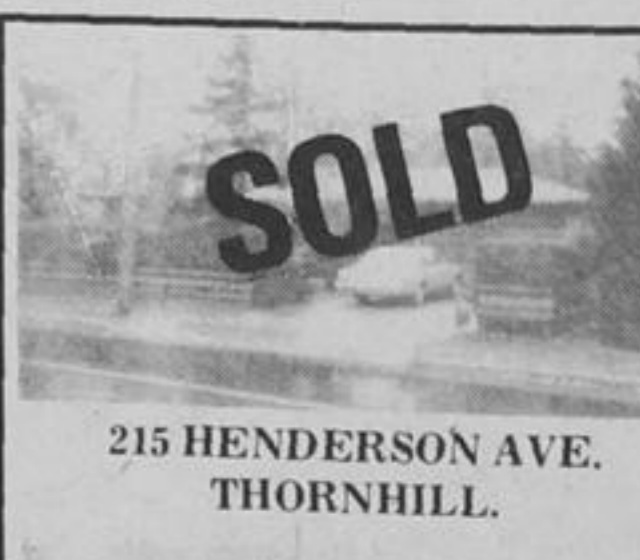
215 HENDERSON AVE. THORNHILL.

TREES, TREES! 2 ACRES Everflowing stream on property. Fully treed estate lot, close to golf course, easy commuting to Toronto. Super buy! Call Judi Sherman at 884-8106.