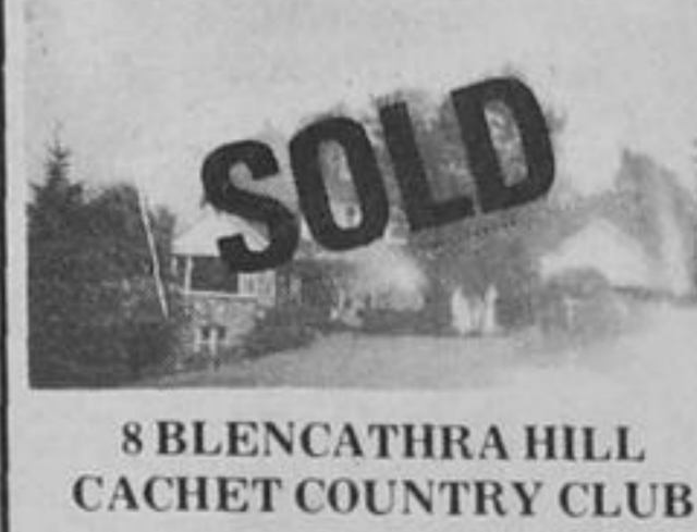
8 BLENCATHRA HILL CACHET COUNTRY CLUB