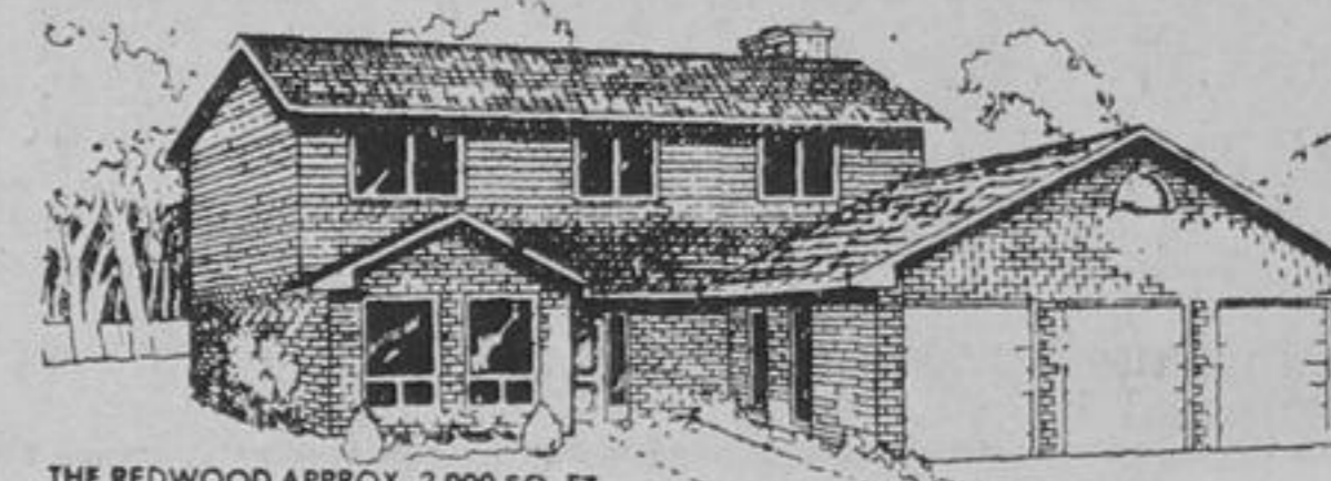
THE REDWOOD APPROX. 2,000 SQ. FT.

1st Mortgage 10% 100 Ft. Lots in Richmond Hill at Beaufort Gardens