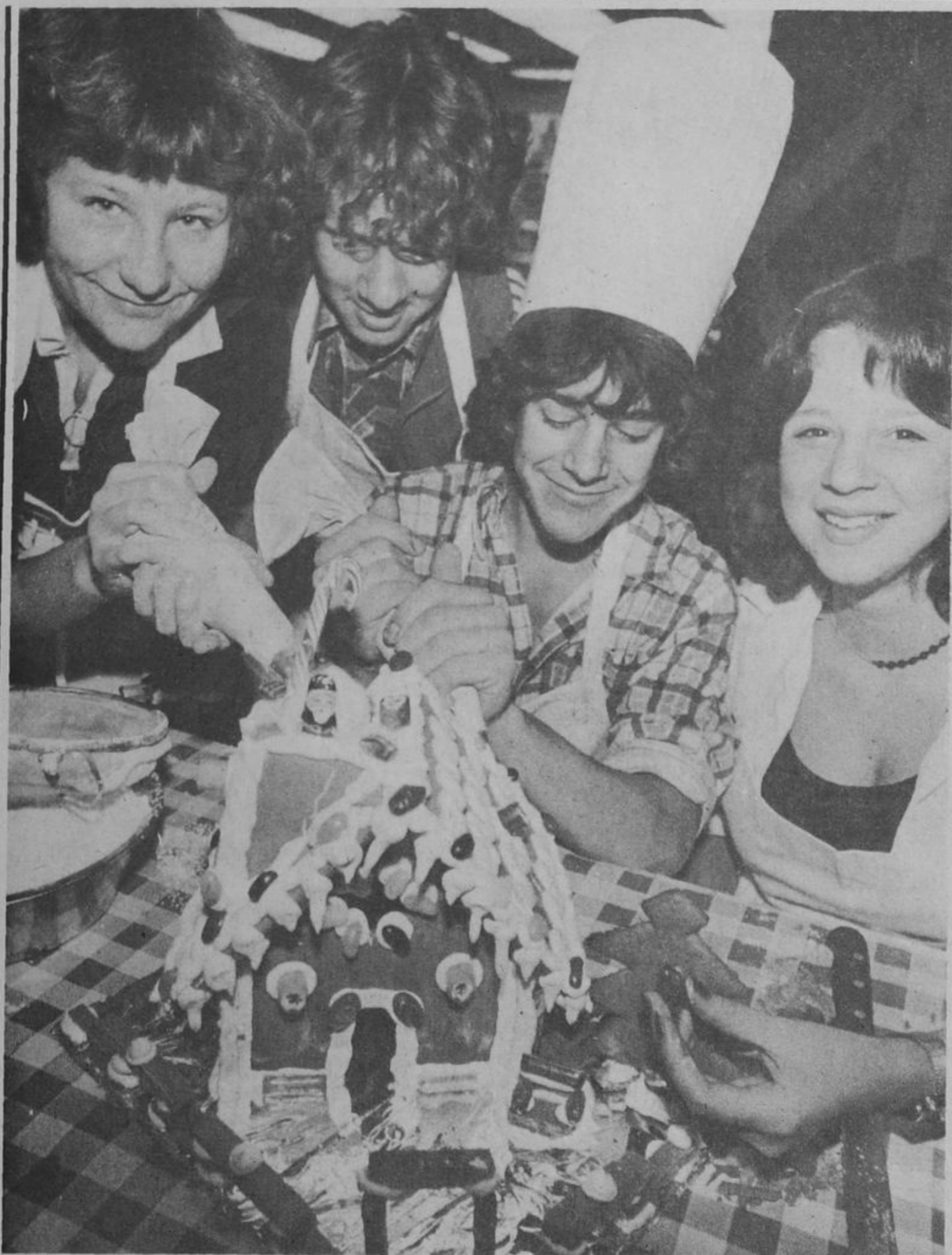
Students from Don Head Secondary School were at Hillcrest Mall last week showing shoppers how to decorate gingerbread