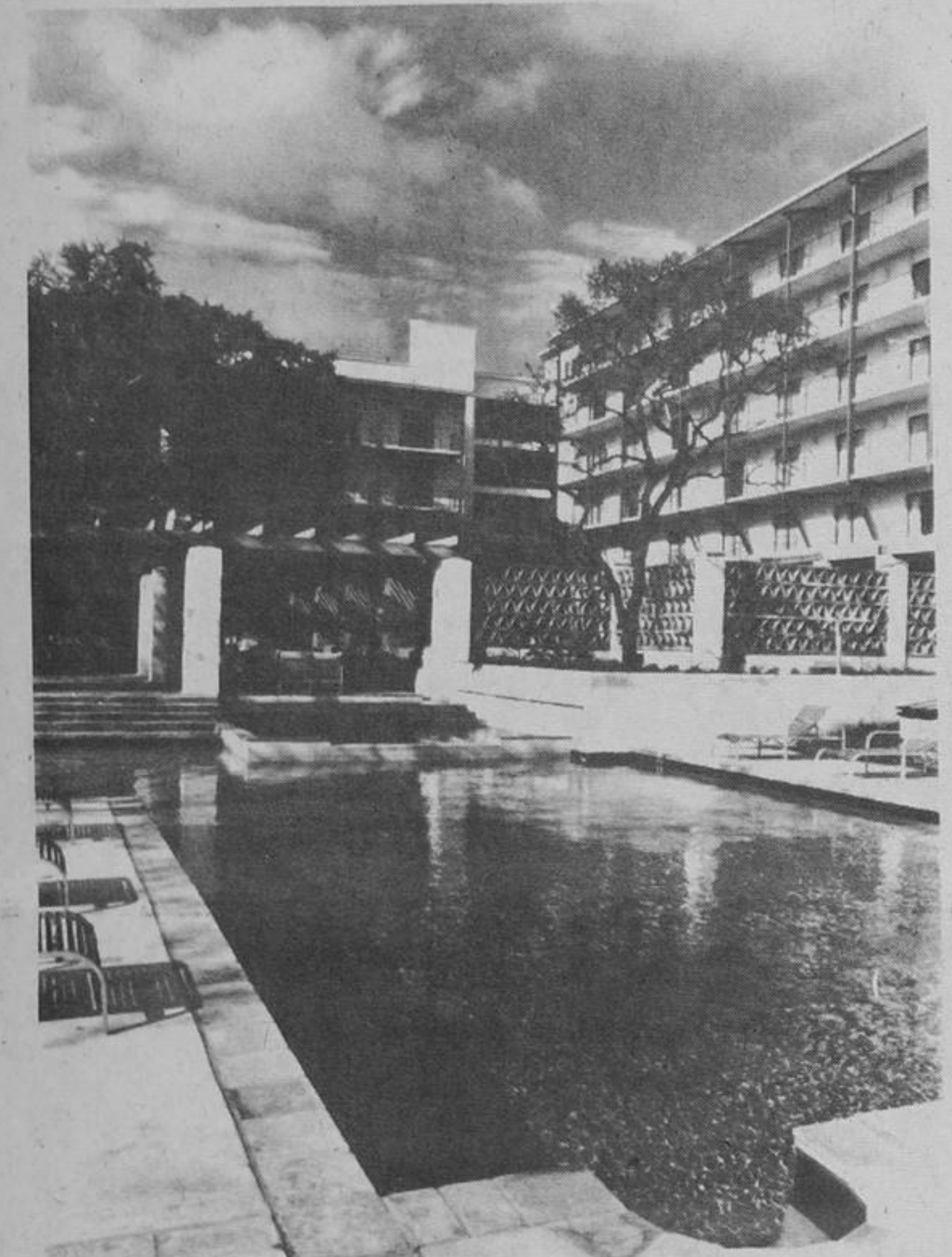
The Four Seasons Plaza Nacional Hotel in San Antonio is built in Spanish style, around a treed courtyard. Here is superb.