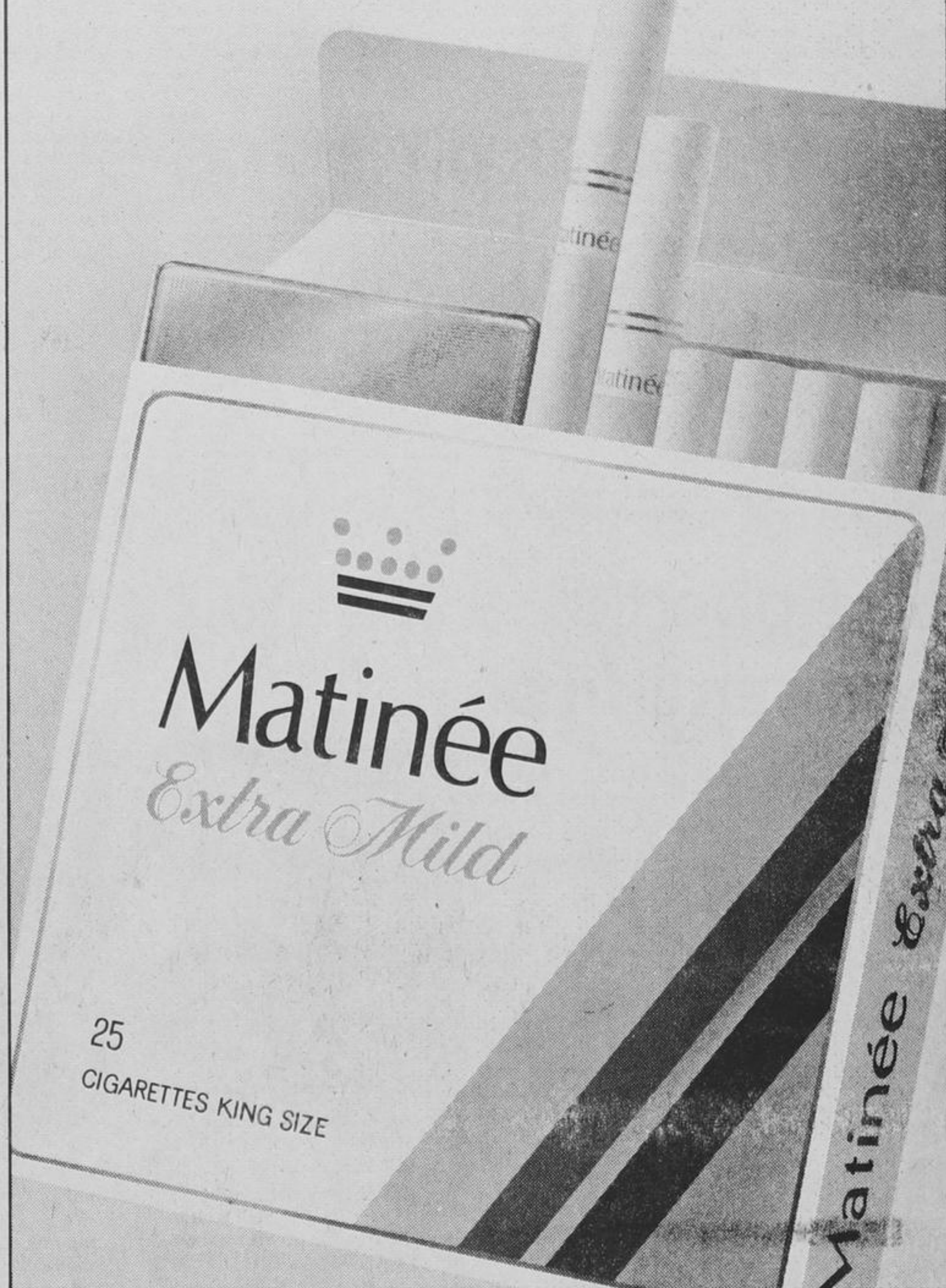
Warning: Health and Welfare Canada advises that danger to health increases with amount smoked - avoid inhaling. Average per cigarette: King Size: 4mg "tar" 0.4mg nicotine.