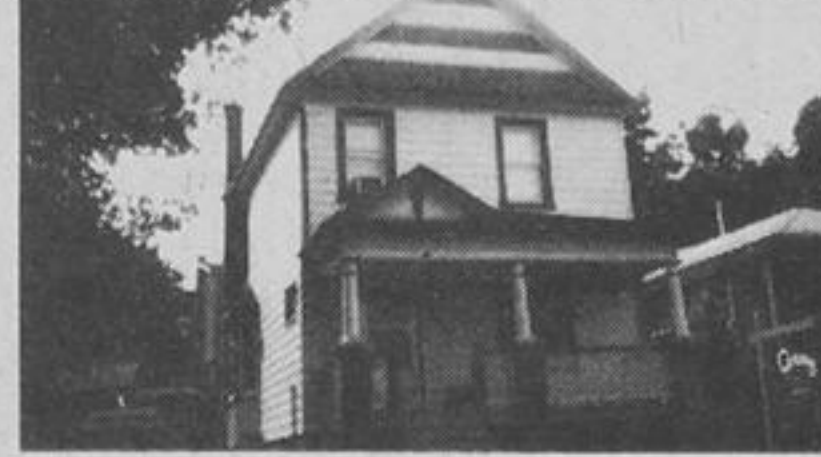
DETACHED - $51,900.

If investment is on your list see this home! Pine floors, loads of wood trim, 3 bedrooms, separate large dining room, super financing, 66' x 120' lot. Needs tender loving care. Call Judi Sherman at 884-8106.