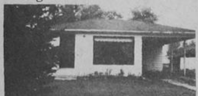
COUNTRY LIVING $49,900.00

Great potential here. Oversize lot with double driveway, large heated workshop. Home has 4 bedrooms, 2 washrooms. Located in area of newer homes. Immediate possession. Thelma George