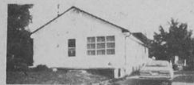
KING CITY — $72,900.

Family Trust FAMILY TRUST CORPORATION REALTOR