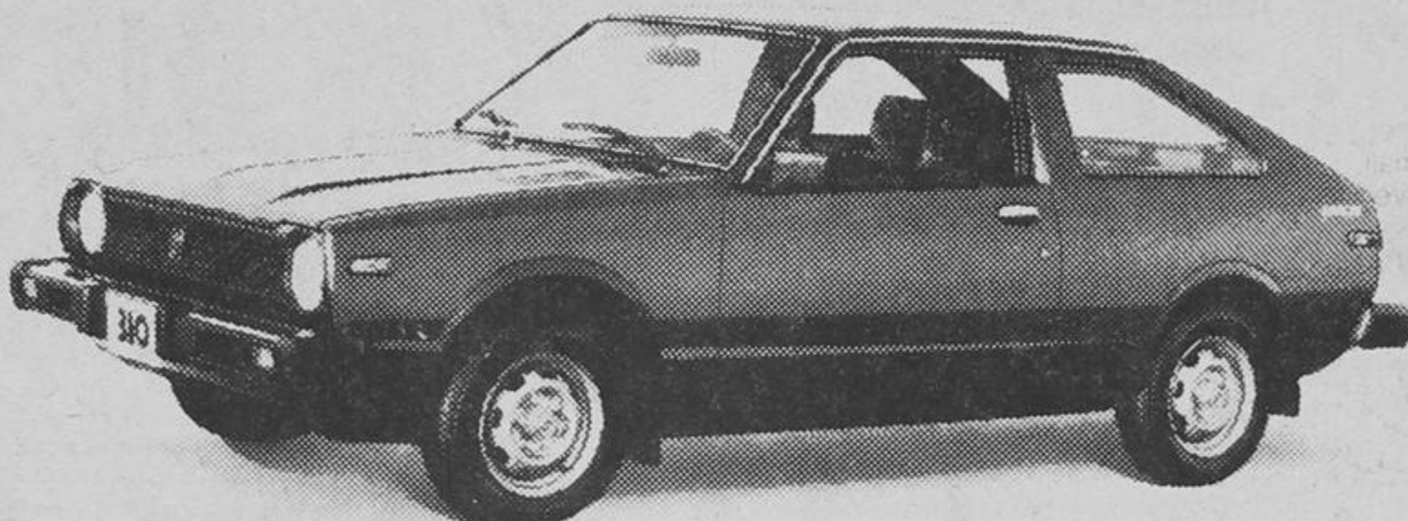
MODEL NO. 310

CLEAROUT PRICES MINIMUM $300 00 DISCOUNTS