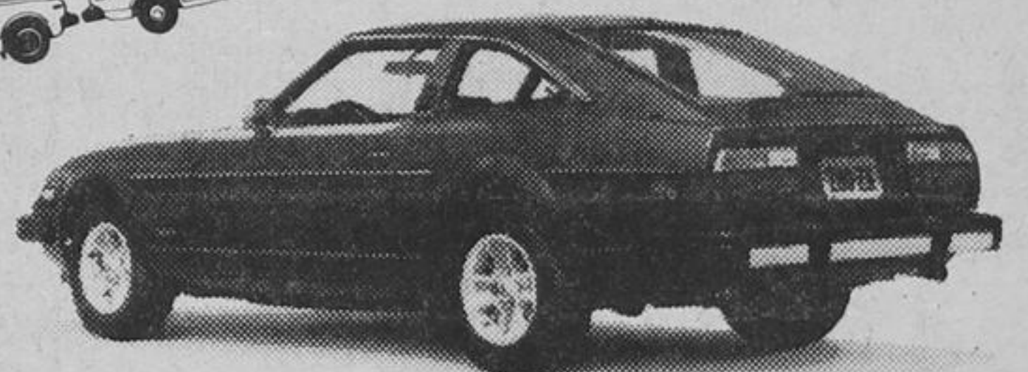
MODEL NO. 280ZX

FREE ONE "T" SHIRT With A Demo Drive (Valid Drivers Licence & One Per Family) TILL 6 P.M., SEPT. 29/79